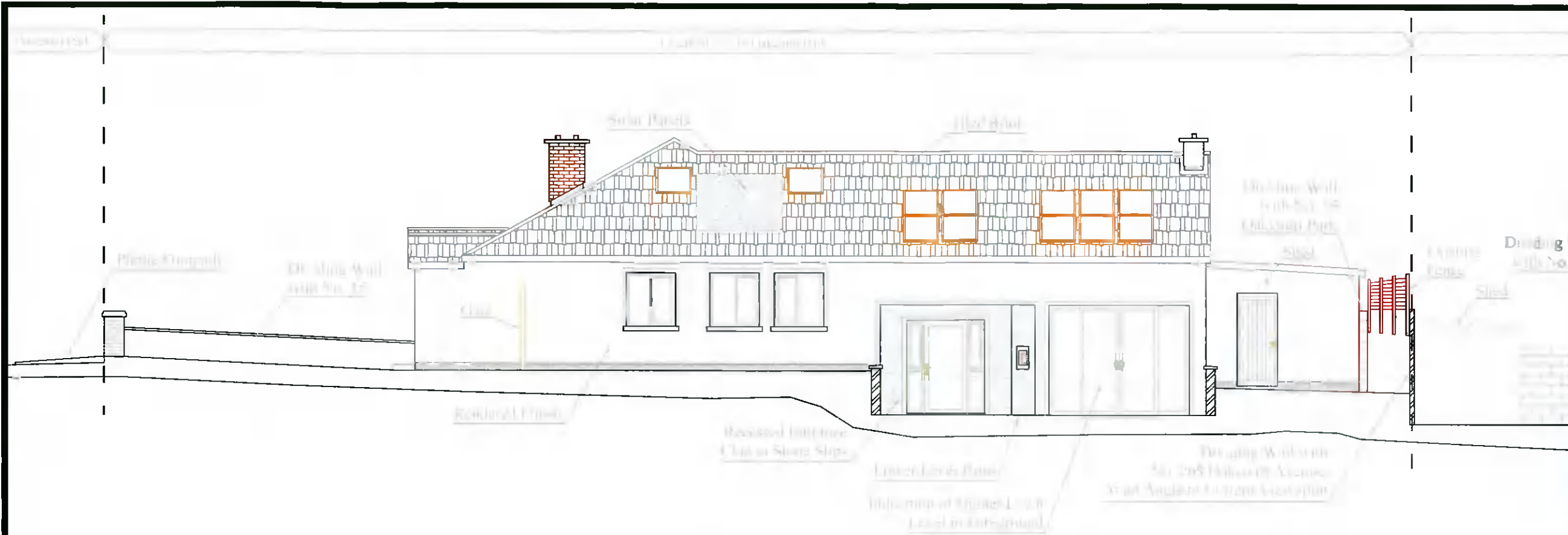
8A Existing Southeast (Side) Elevation, Part A Scale: 1:100