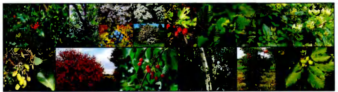
Native Hedgerow Mix