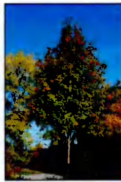
Native Rowan Tree