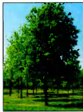
Native Oak Tree