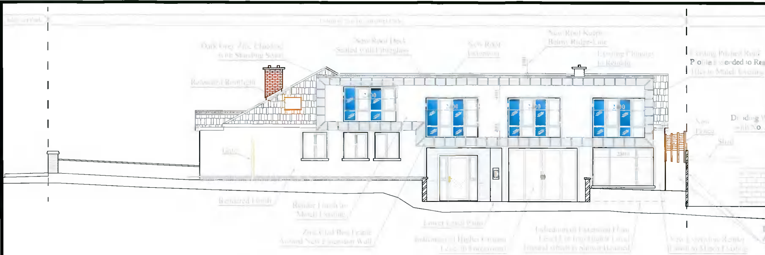
21A Proposed Southeast (Side) Elevation, Part A Scale: 1:100