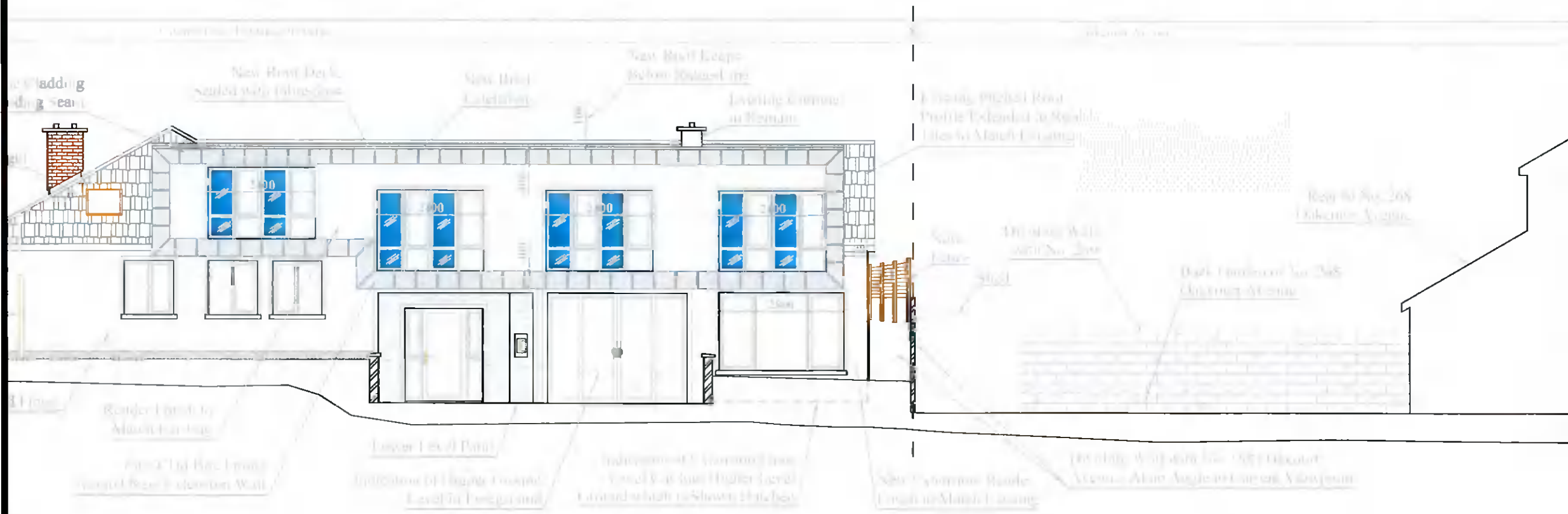
21B Proposed Southeast (Side) Elevation, Part B Scale: 1:100

COPYRIGHT No part of this document may be re-produced or transmitted in any form or stored in any retrieval system of any nature without the written permission of iStruct Consulting Engineers as copyright holder except as agreed for use on the project for which the document was originally issued