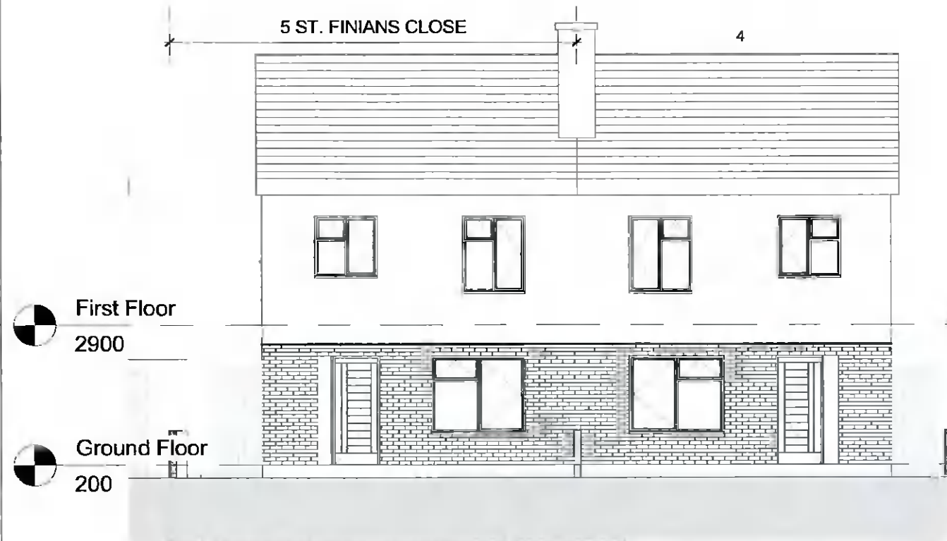
FRONT ELEVATION PROPOSED -EXISTING 1 : 100