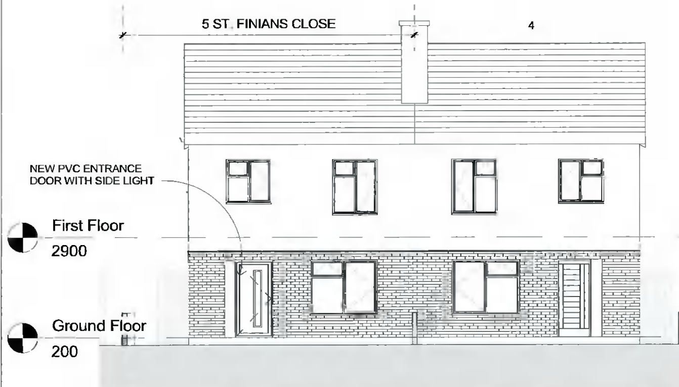
FRONT ELEVATION PROPOSED 1 : 100