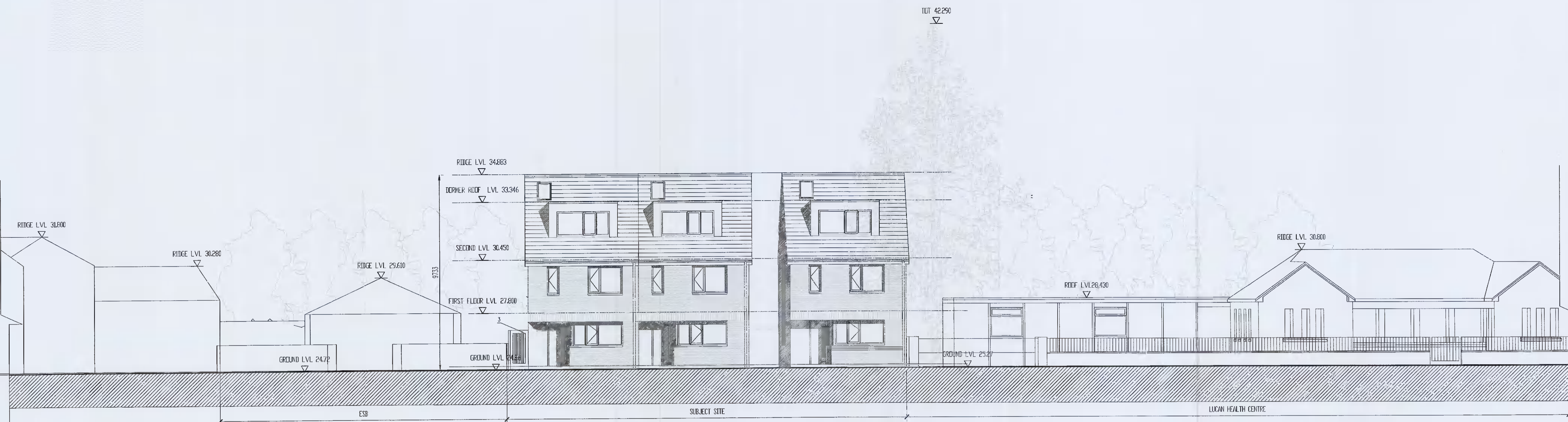
CONTIGUOUS ELEVATION SCALE 1:100