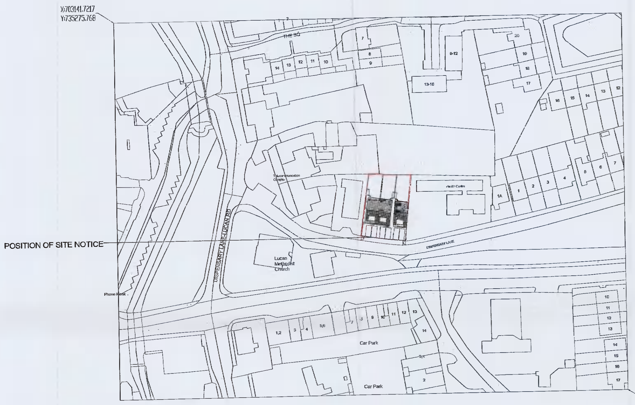
SITE LOCATION PLAN SCALE 1:1000

Description Digital Cartographic Model (DEM) Publisher / Source Ordnance Survey Ireland (OS) Data Source / Reference PRIME2 File Format Autodesk AutoCAD DWG, R2013 File Name V_S223001.dwg Clip Extent / Area of Interest (AOI) U_XMIN= 703347217.735037686 U_XMAX= 703347217.735037686 U_YMIN= 703347217.7352757686 U_YMAX= 703347217.7352757686 Projection / Spatial Reference Projection: BNE195 Datum: Irish Transverse Mercator Centre Point Coordinates X,Y= 703347217.735037686 Reference Index Map Series / Map Sheets M,000 1 3094-25 Data Extraction Date Date: 12-Aug-2021 Source Data Release DLMS Release V11431E Data Extraction Date Date: 12-Aug-2021 Source Data Release DLMS Release V11431E Product Version Version: 1.0 License / Copyright Ordnance Survey Ireland Terms of Use apply. Please visit: www.osi.ie/about/terms-conditions ©Ordnance Survey Ireland, 2021