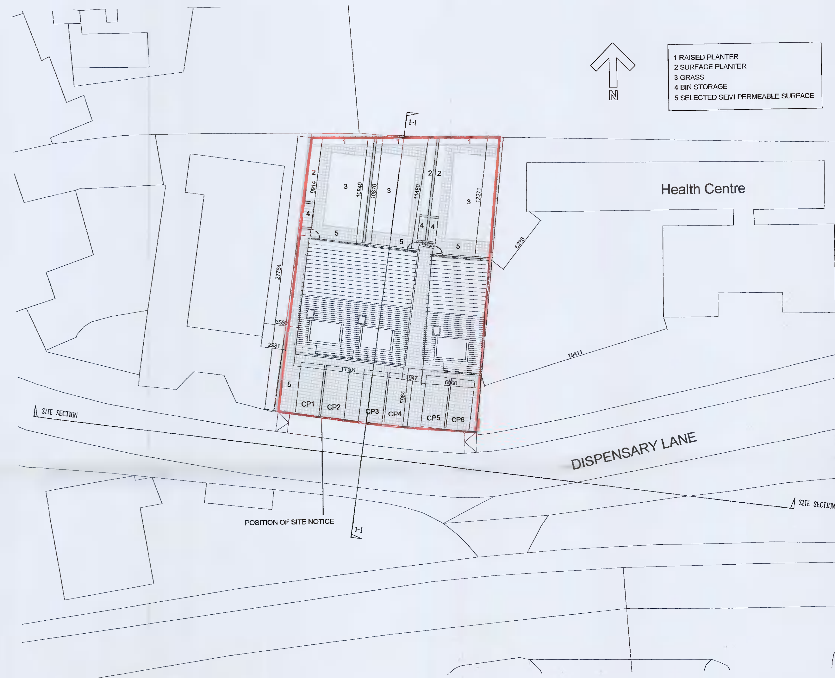
SITE PLAN - ROOF PLAN SCALE 1:200