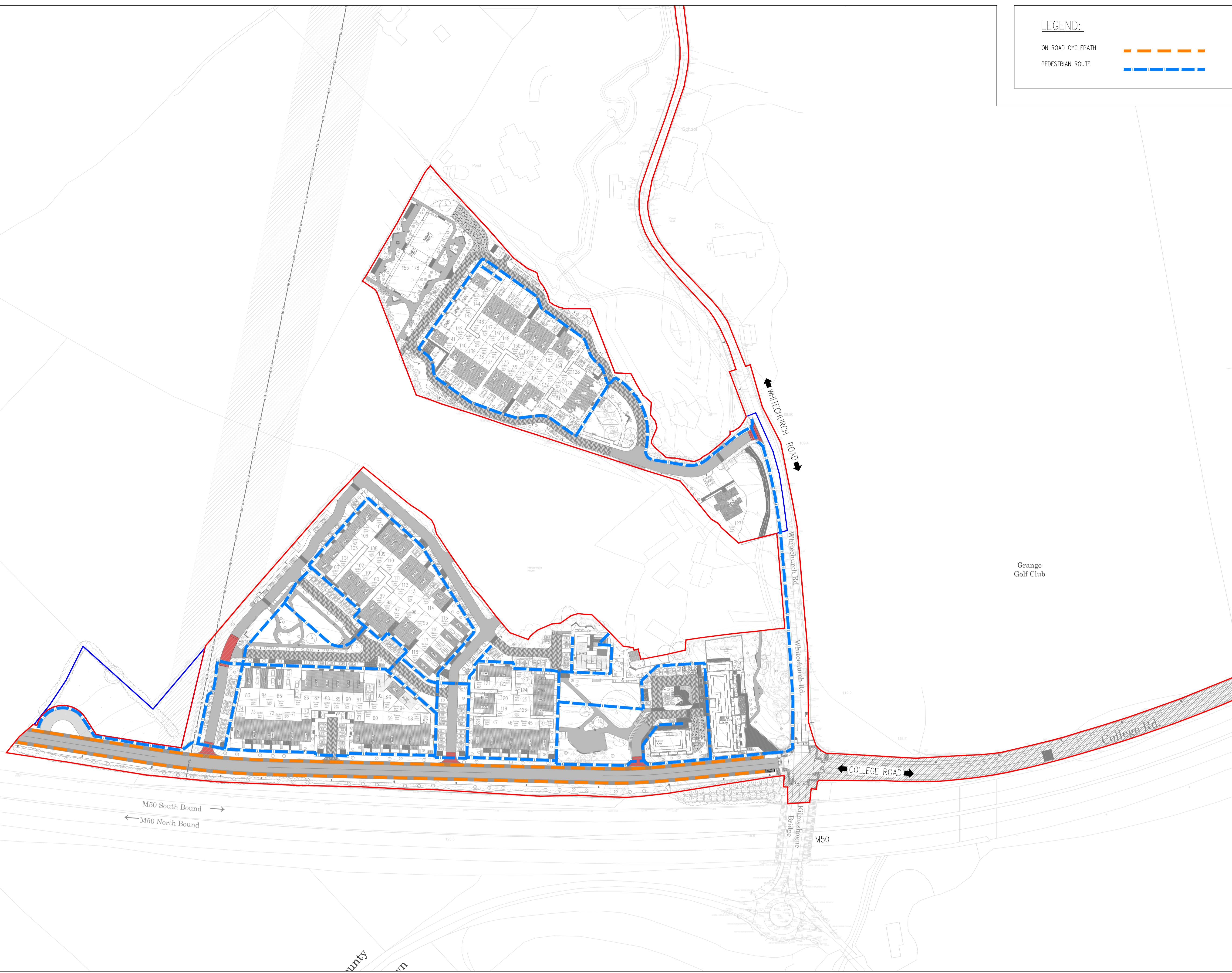
PEDESTRIAN AND CYCLING LINKS PLAN SCALE: 1:1000