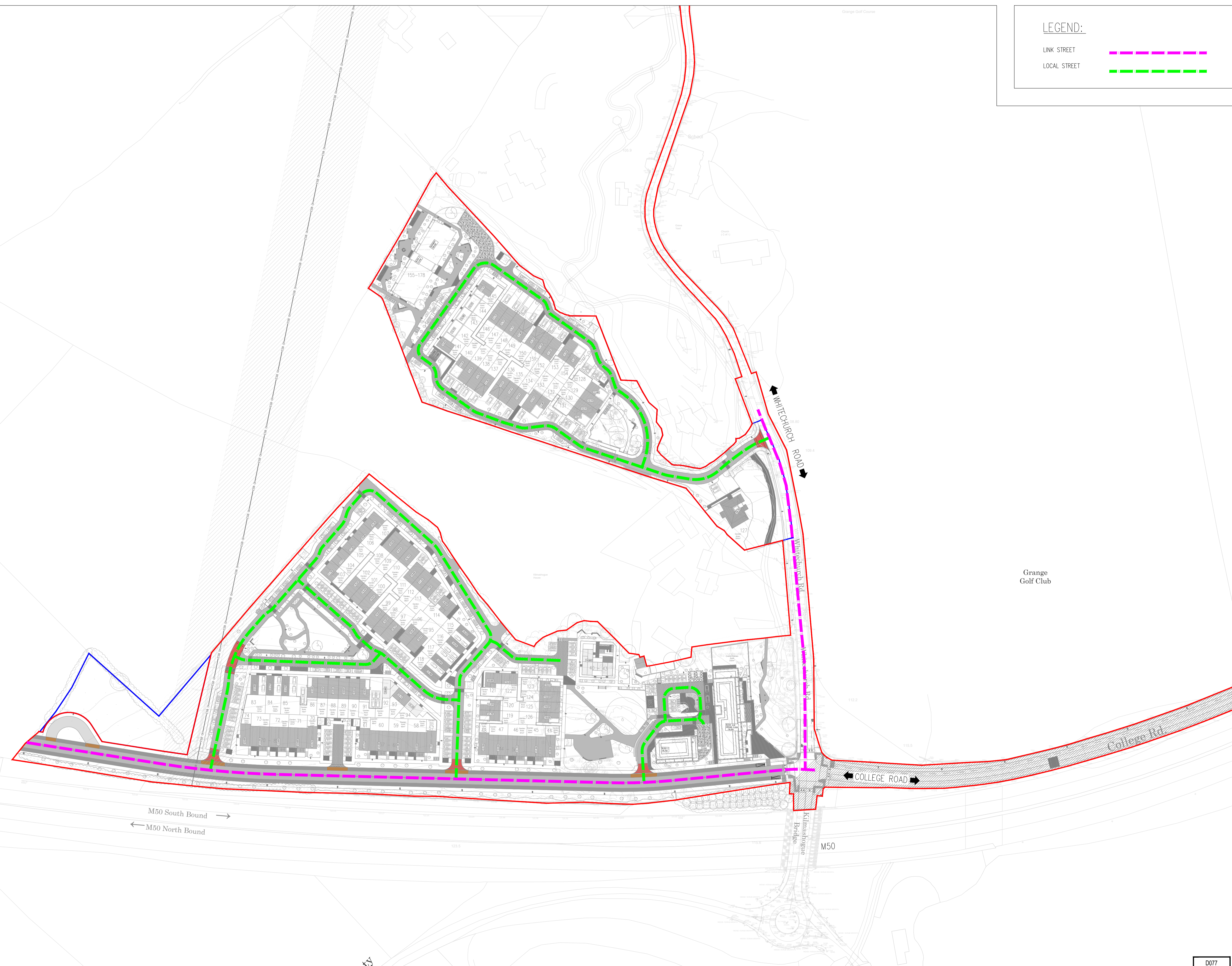
LINK STREET AND LOCAL STREET PLAN SCALE: 1:1000

PLANNING DRAWING NOT FOR CONSTRUCTION THIS DRAWING HAS BEEN ISSUED FOR INFORMATION PURPOSES ONLY AND MUST NOT BE USED FOR CONSTRUCTION UNDER ANY CIRCUMSTANCES