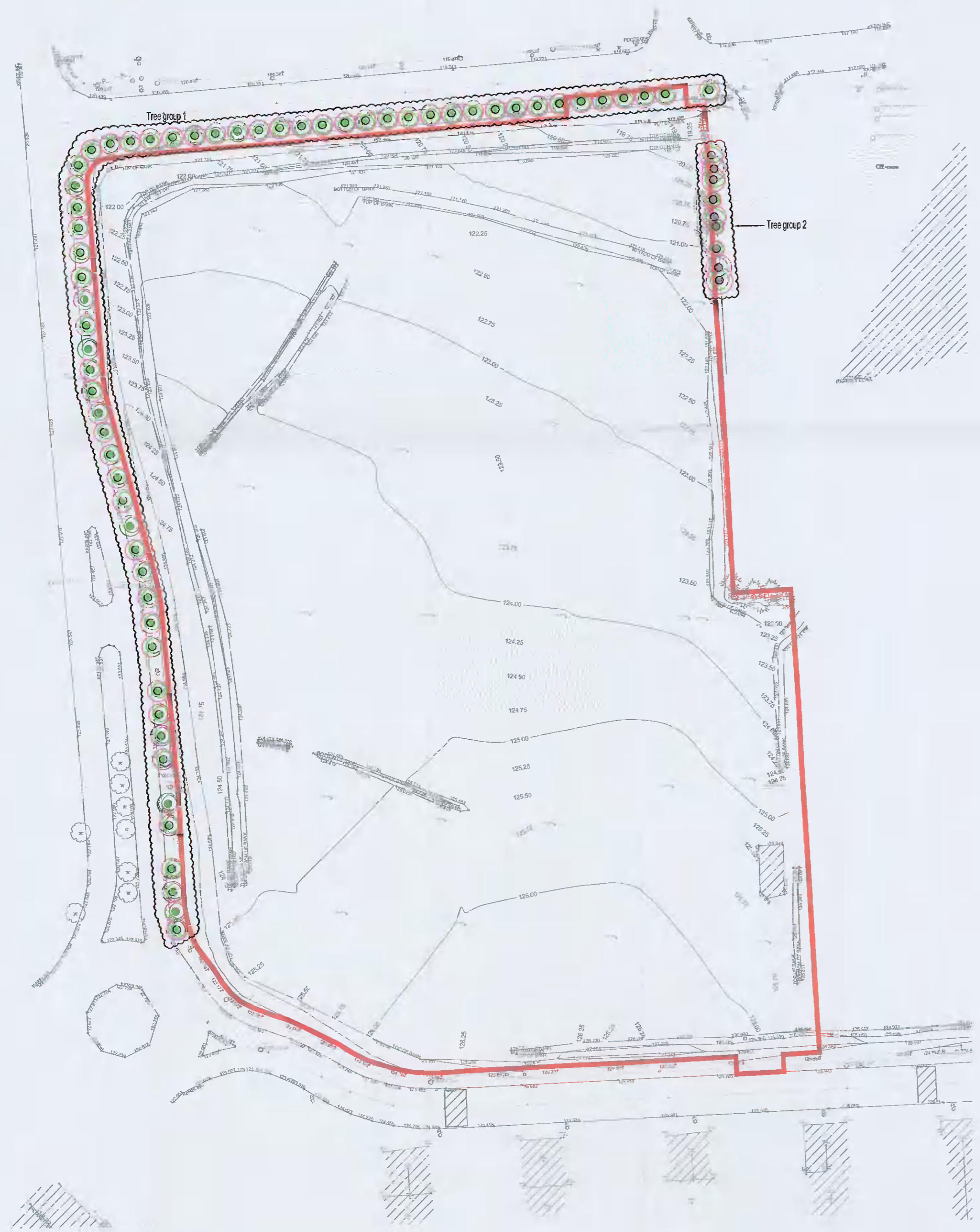
Tree Survey/Constraints Plan Scale: 1:500