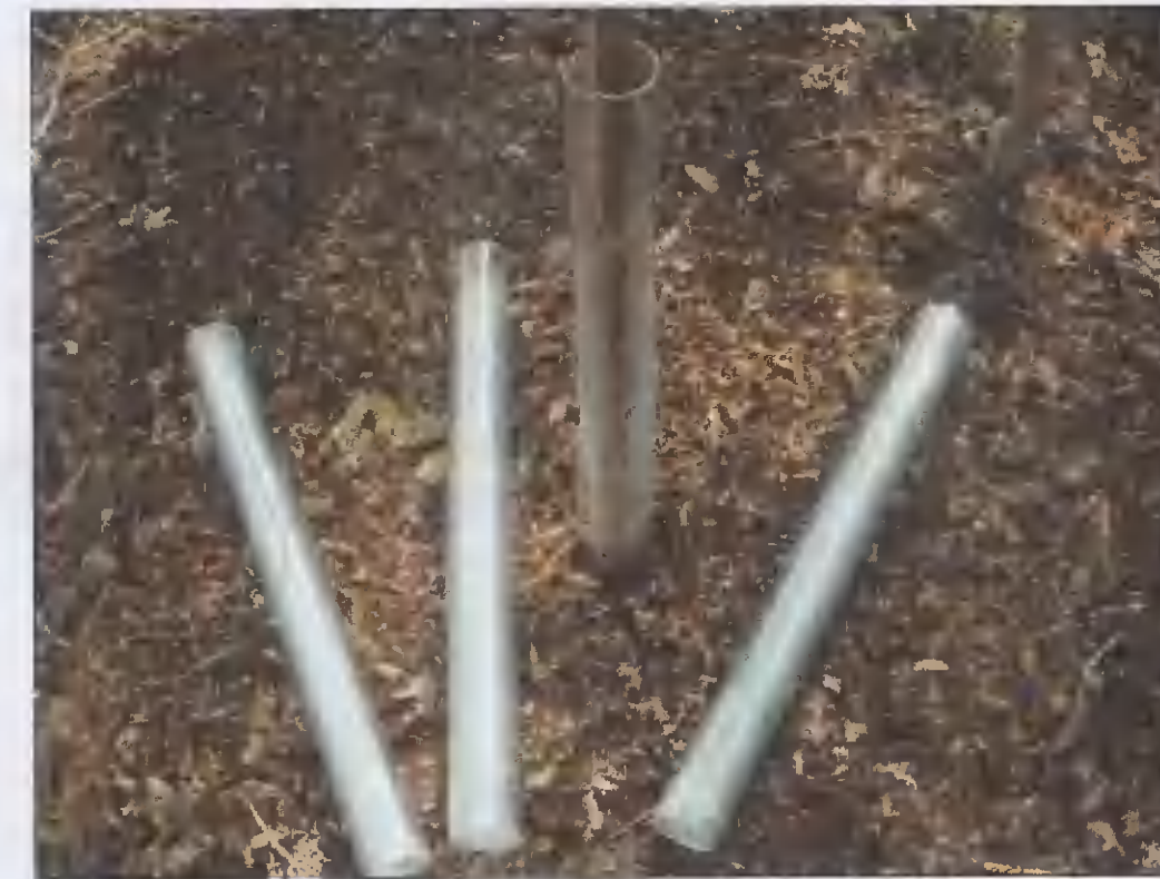
Clear Spiral Tree Guard