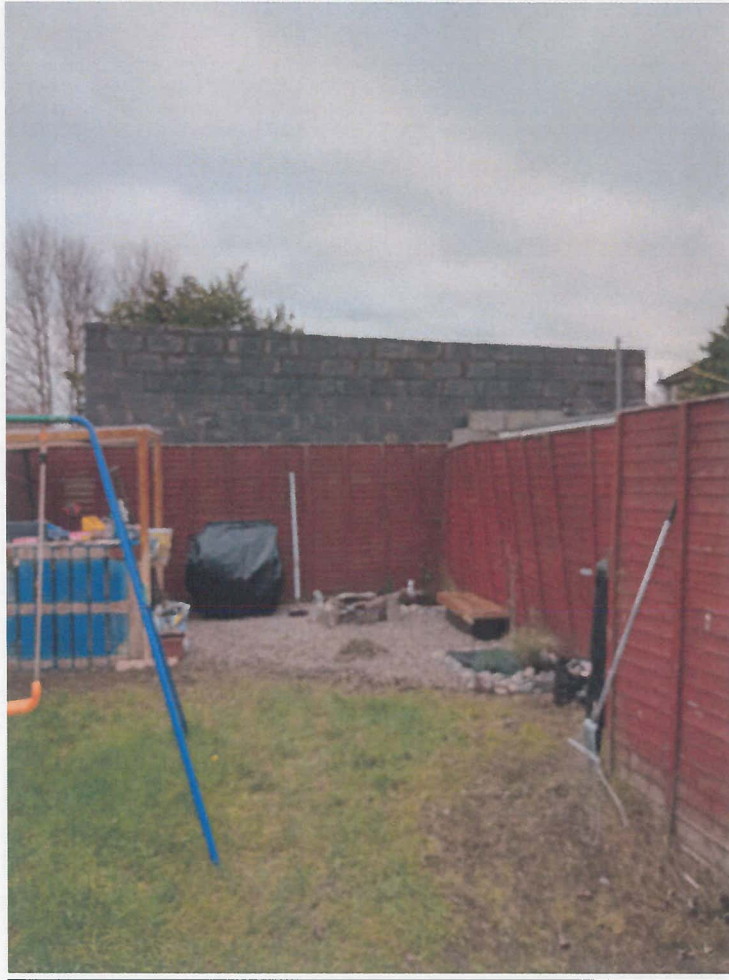
1. Photo taken from the back garden of house no. 17 Church View