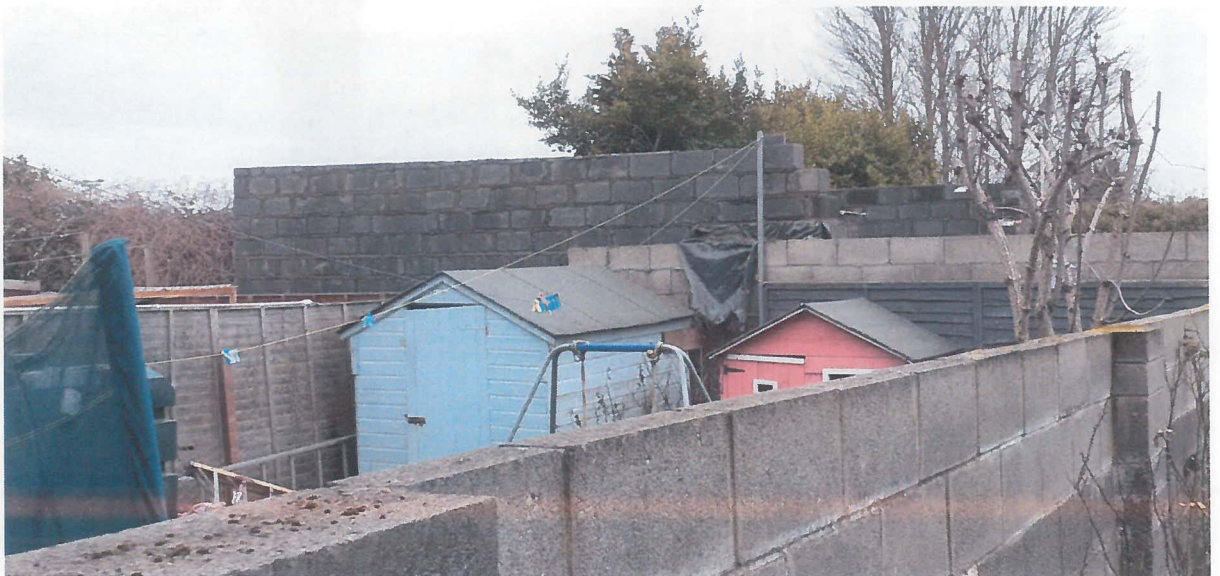
2. Photo taken at eye level from the back garden of house no. 19 Church View of structure without the roof.