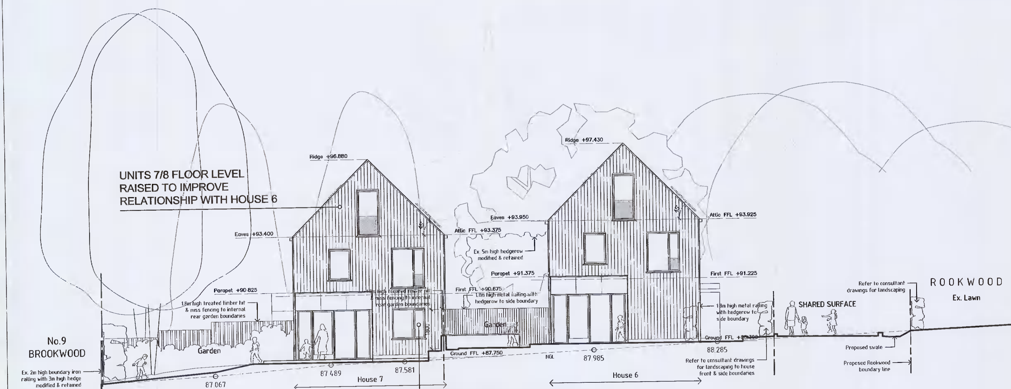
WEST ELEVATION (to Rookwood View) UNIT 7 KITCHEN / DINING WINDOW RELOCATED FROM FRONT TO GARDEN ELEVATION