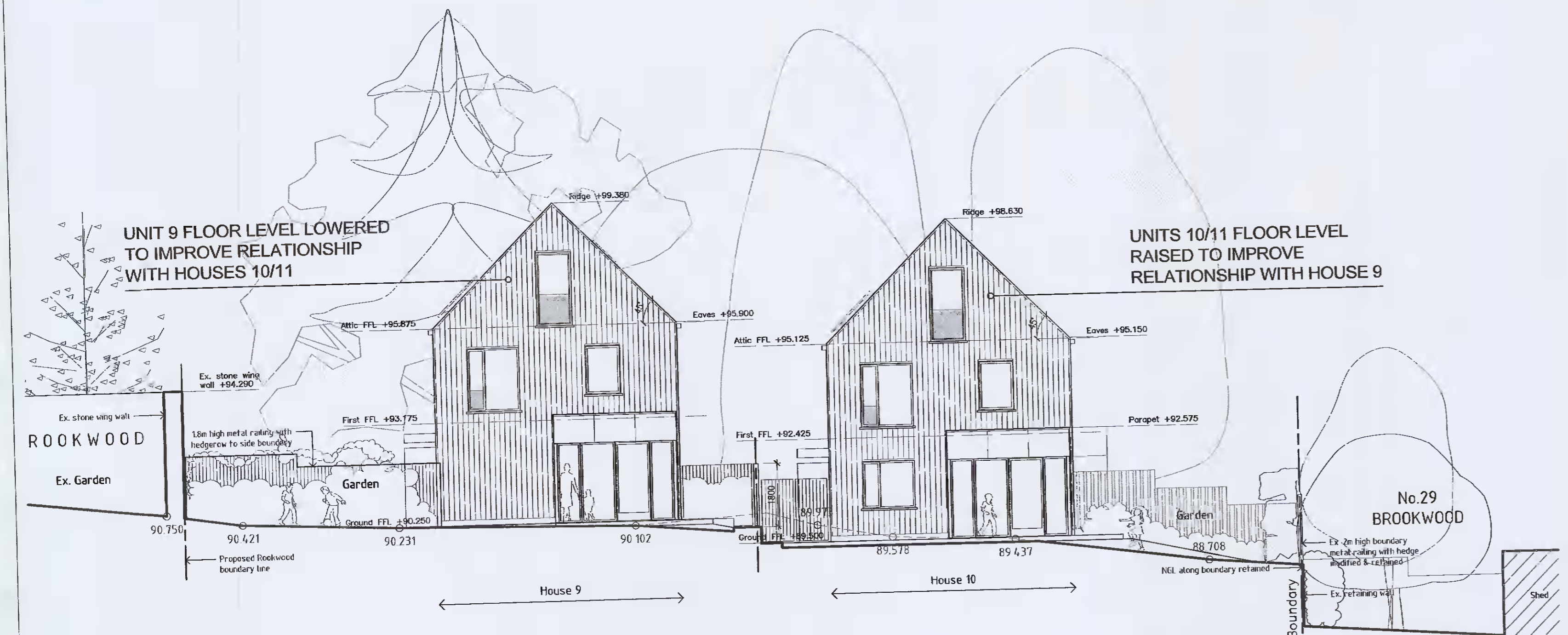
SOUTH-EAST ELEVATION (Units 9 & 10/11) (to SHD site & Springvale)