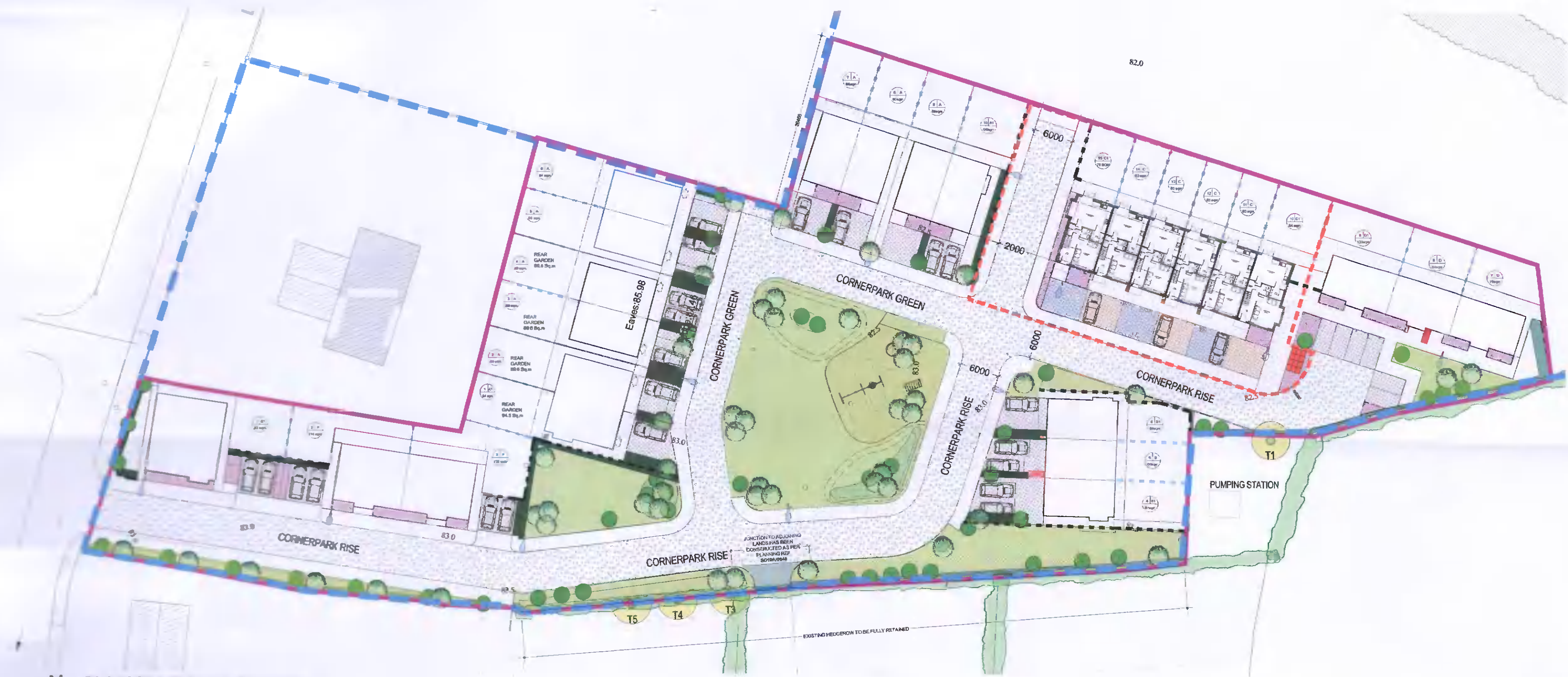
N I PROPOSED SITE LAYOUT PLAN CORNERPARK, NEWCASTLE. Scale 1:500