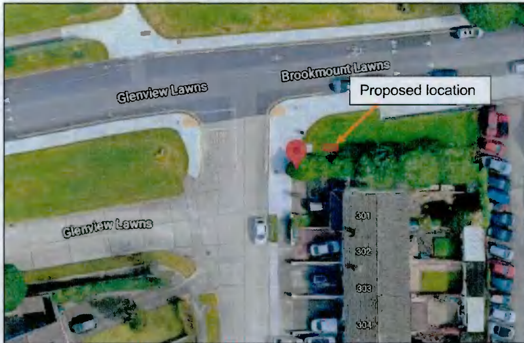
Figure 1- Site Location

The proposed location for the new DRI is in grass verge at entrance to Glenview Lawns housing estate.