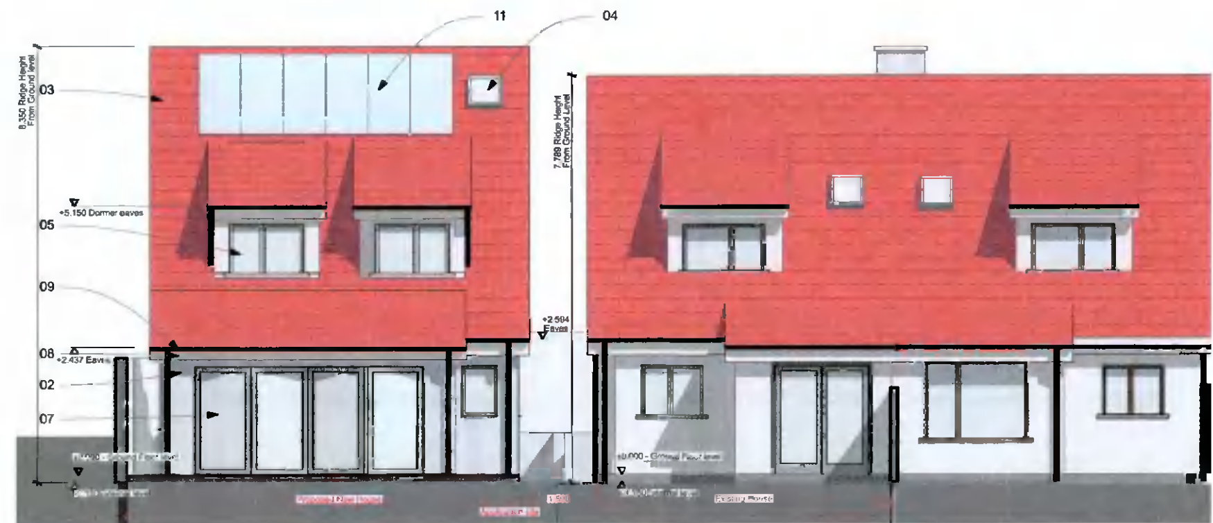
02 Contiguous Rear Elevation - South - Proposed 1:100