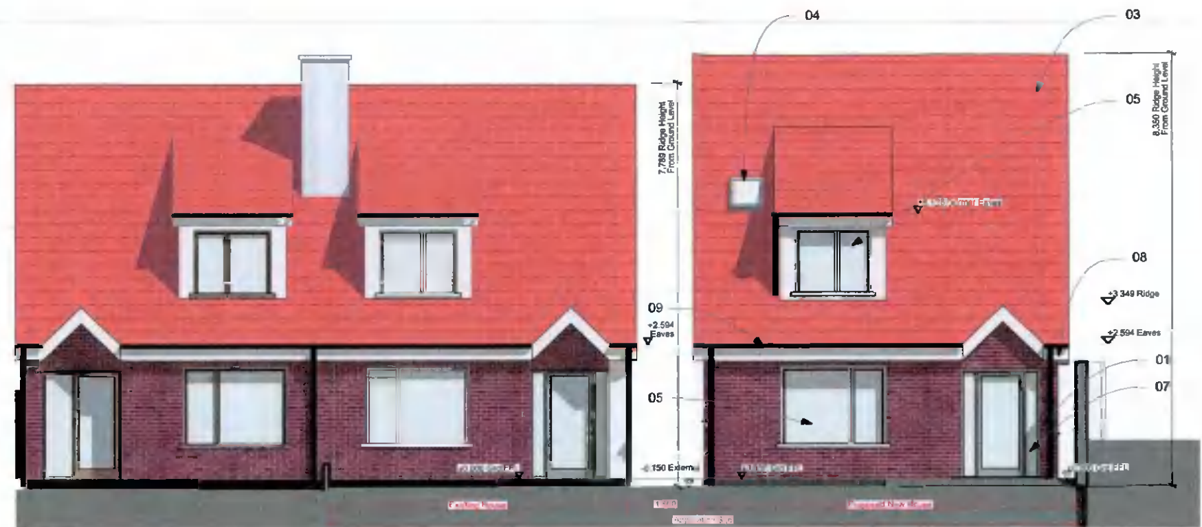
01 Contiguous Front Elevation - North - Proposed 1:100