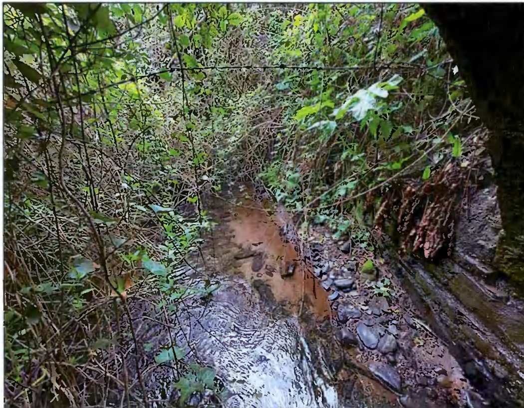
Figure 3 – Map Identifying Sample Site 2 (Midstream).