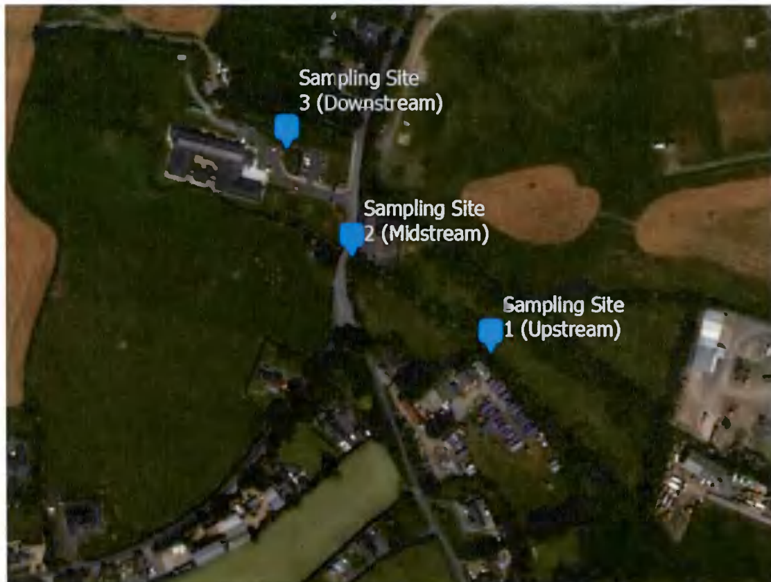
Figure 1 – Map Identifying Stations Sampled as Part of this Assessment