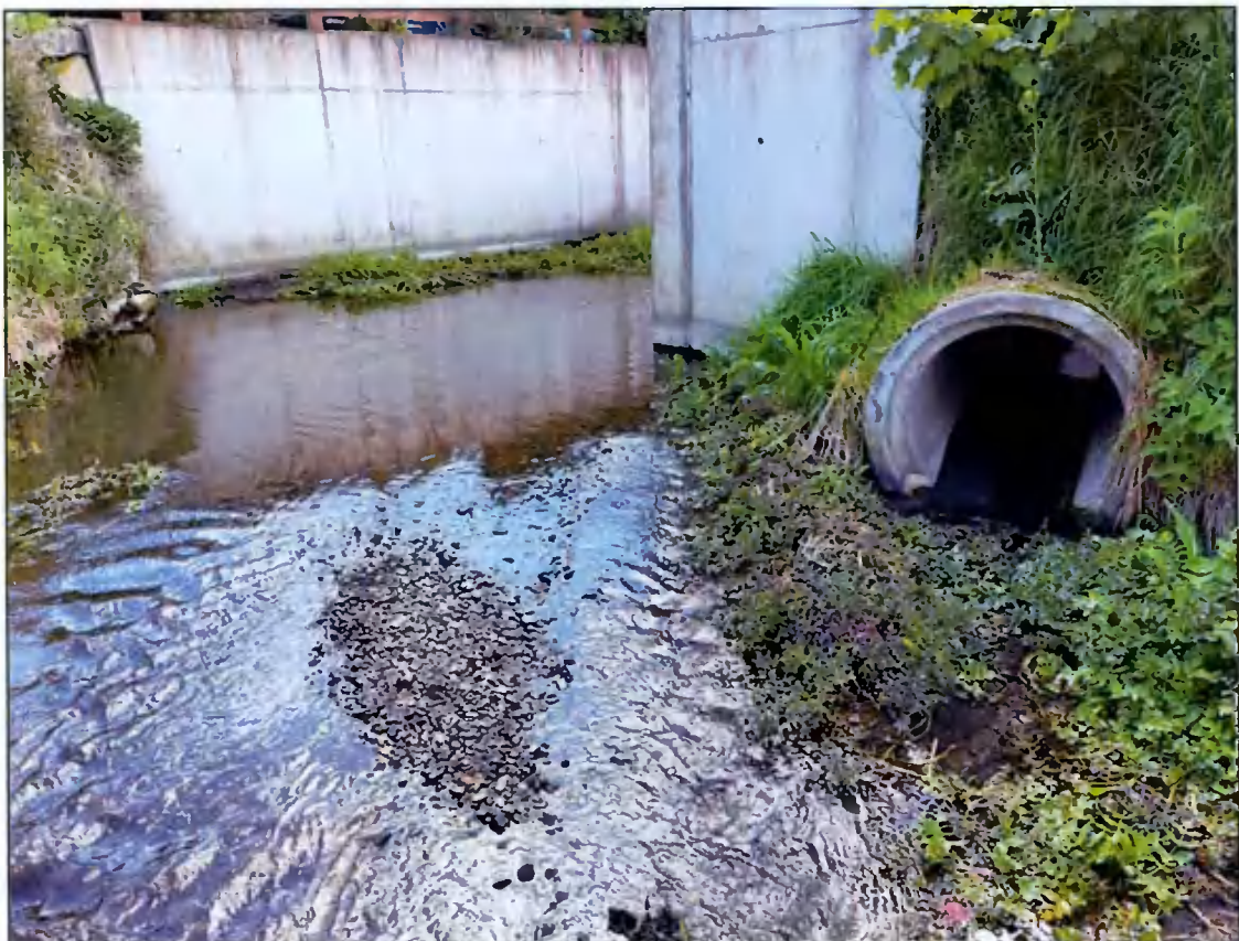
Figure 4 – Map Identifying Sample Site 3 (Downstream).