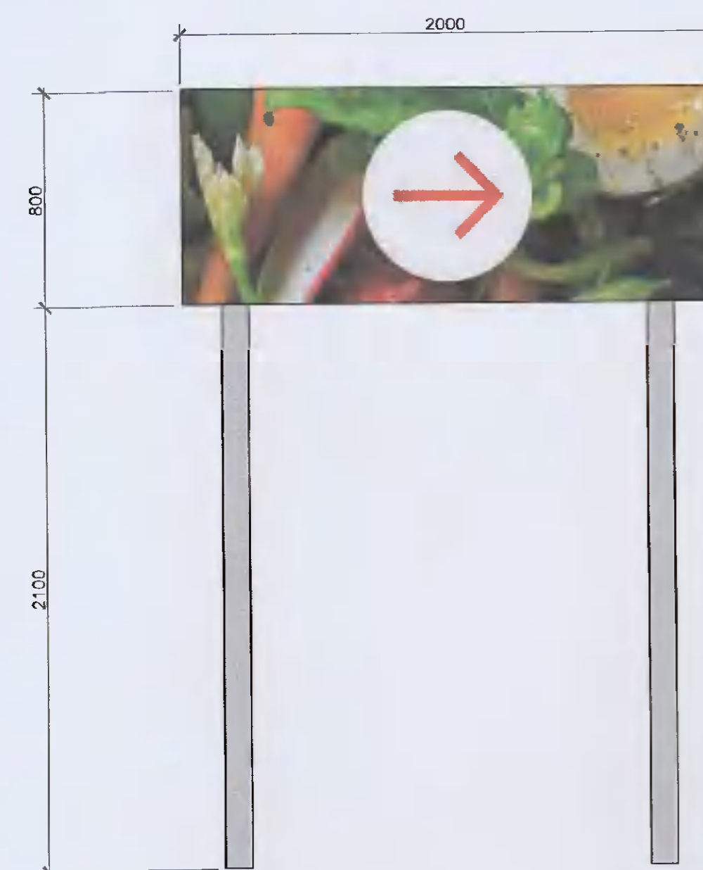
INTERIOR VIEW SIGNAGE – SIDE ELEVATION SCALE 1:20