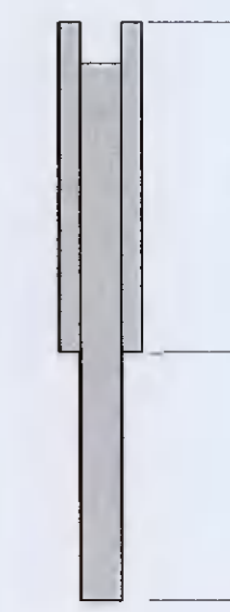
SIDE VIEW – FRONT ELEVATION SCALE 1:20

2000x800mm ALUMINIUM COMPOSITE PANEL WITH FULL COLOUR LAMINATED GRAPHICS FRONT AND BACK, FIXED TO GALVANISED MILD STEEL BOX SECTION SET INTO CONCRETE BASE