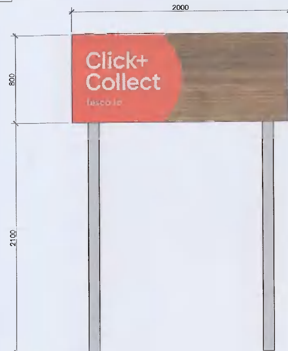
EXTERIOR VIEW SIGNAGE – SIDE ELEVATION SCALE 1:20