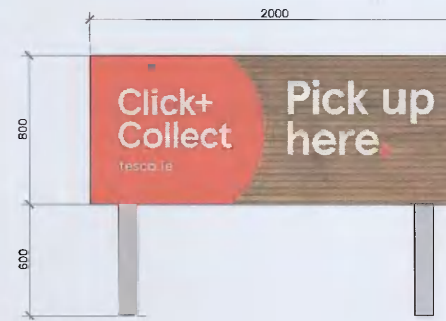
EXTERIOR VIEW SIGNAGE – SIDE ELEVATION SCALE 1:20

2000x800mm ALUMINIUM COMPOSITE PANEL WITH FULL COLOUR LAMINATED GRAPHICS FRONT AND BACK, FIXED TO GALVANISED MILD STEEL BOX SECTION SET INTO CONCRETE BASE