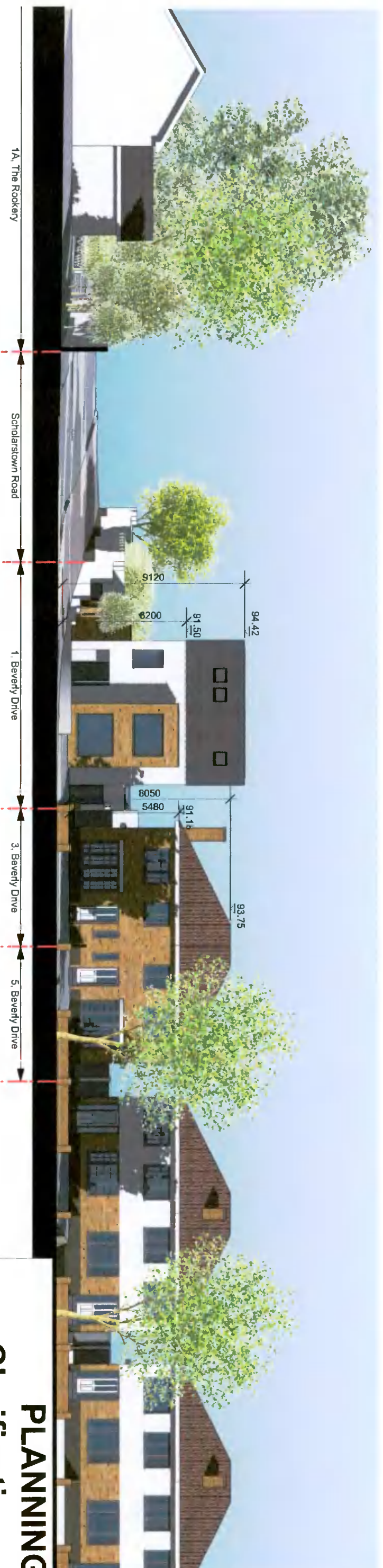
Contiguous front elevation (North) to Beverly Drive - Proposed