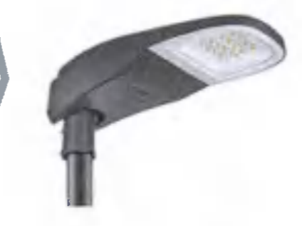
CREE LIGHTING - ENERGY UNO LED STREET / AREA LUMINAIRE MOUNTED ON 8M POLE