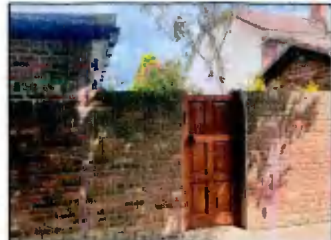
PHOTO OF GATE