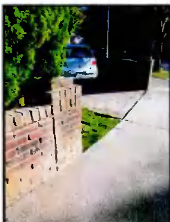
NEW LOCATION OF FRONT PIER FRONT ELEVATION