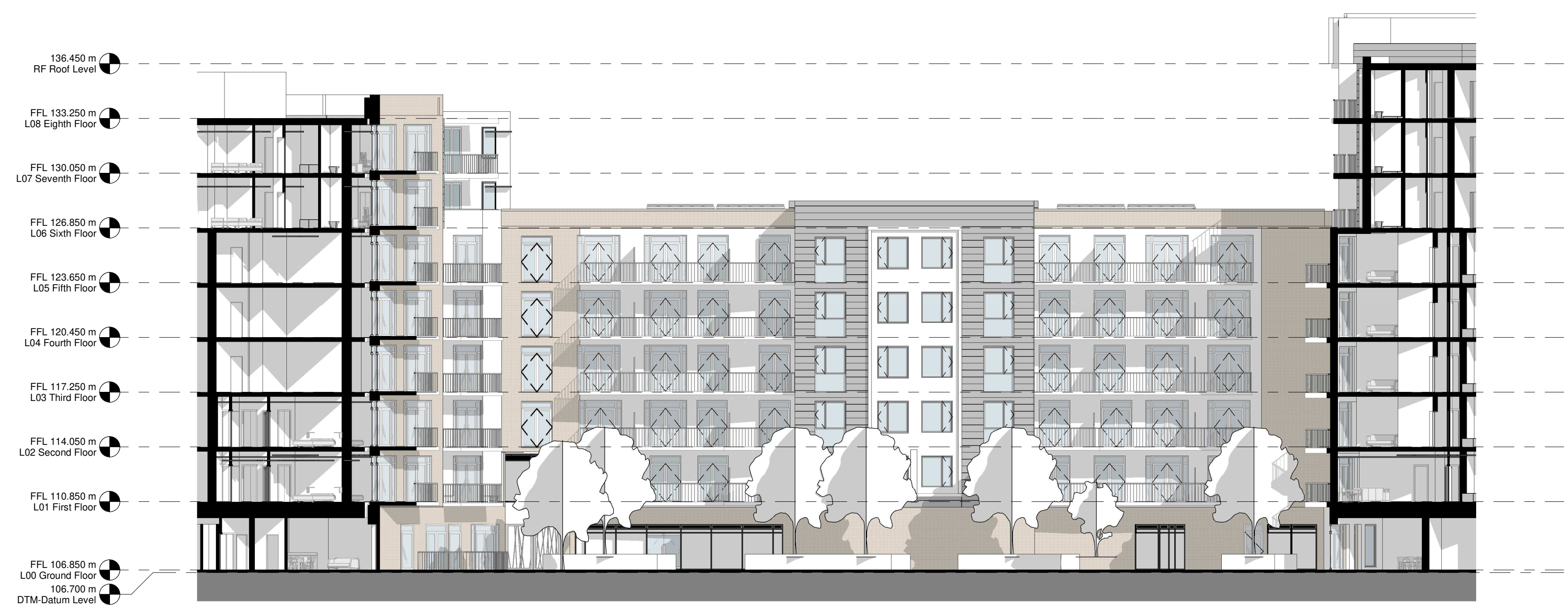
Block C - Proposed East Elevation 1 : 200