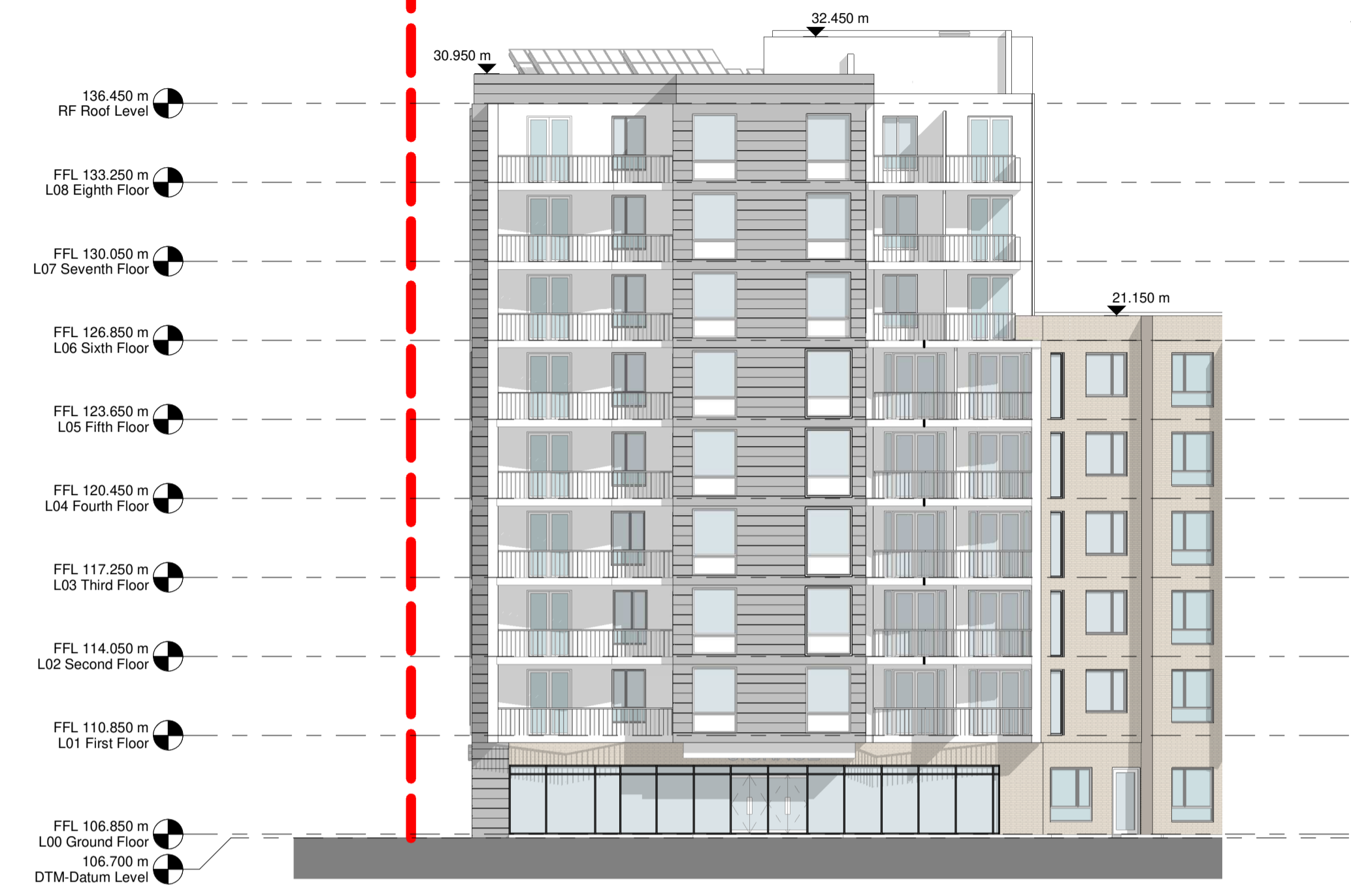
Block B - Proposed West - NO AMENDMENT PROPOSED Elevation 1 : 200