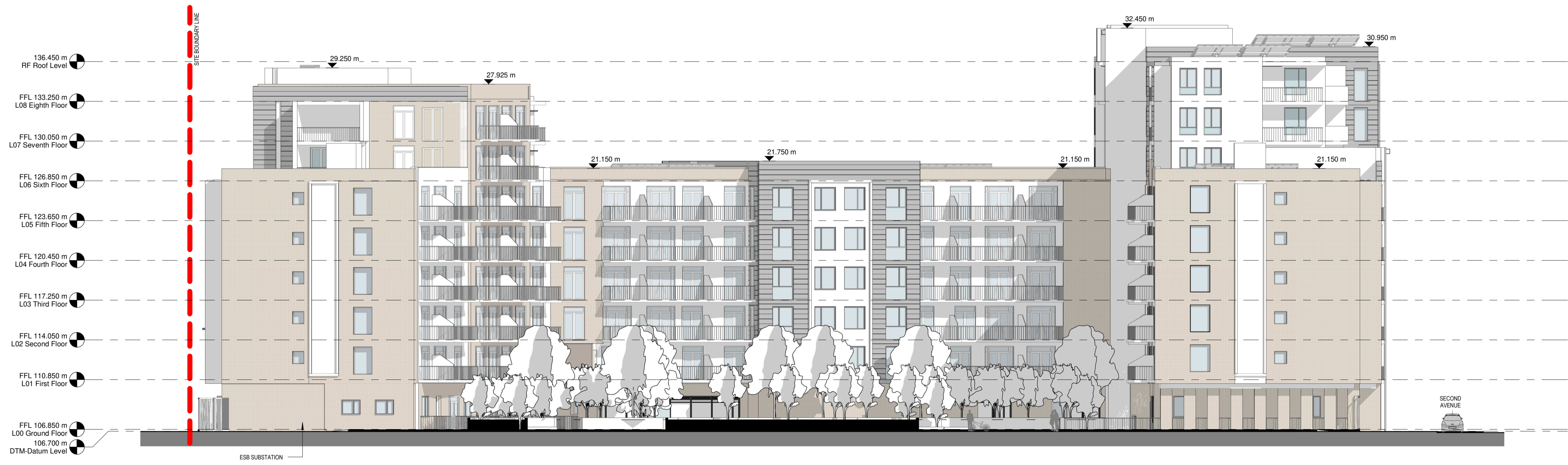
Block A - C & D - Proposed East Elevation 1 : 200