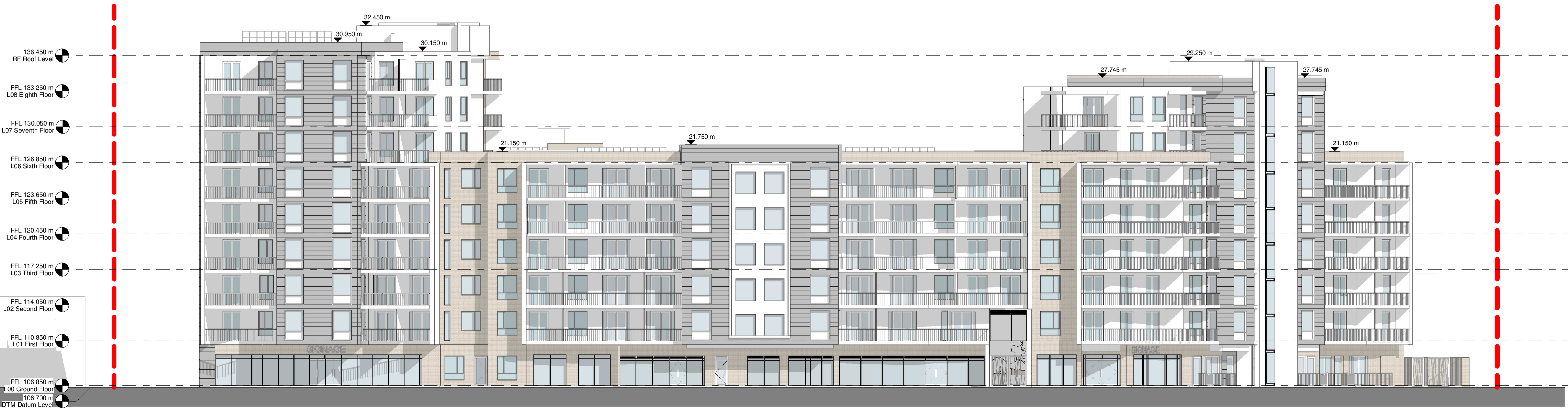
Block C - Proposed West Elevation 1 : 200