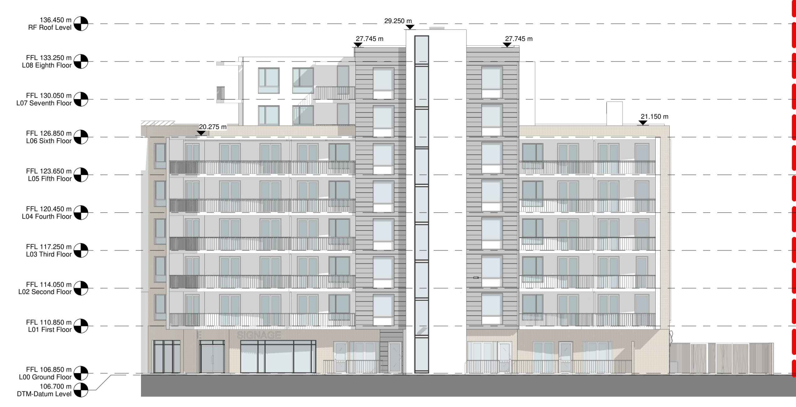
Block C - Proposed South Elevation 1 : 200 - NO AMENDMENT PROPOSED