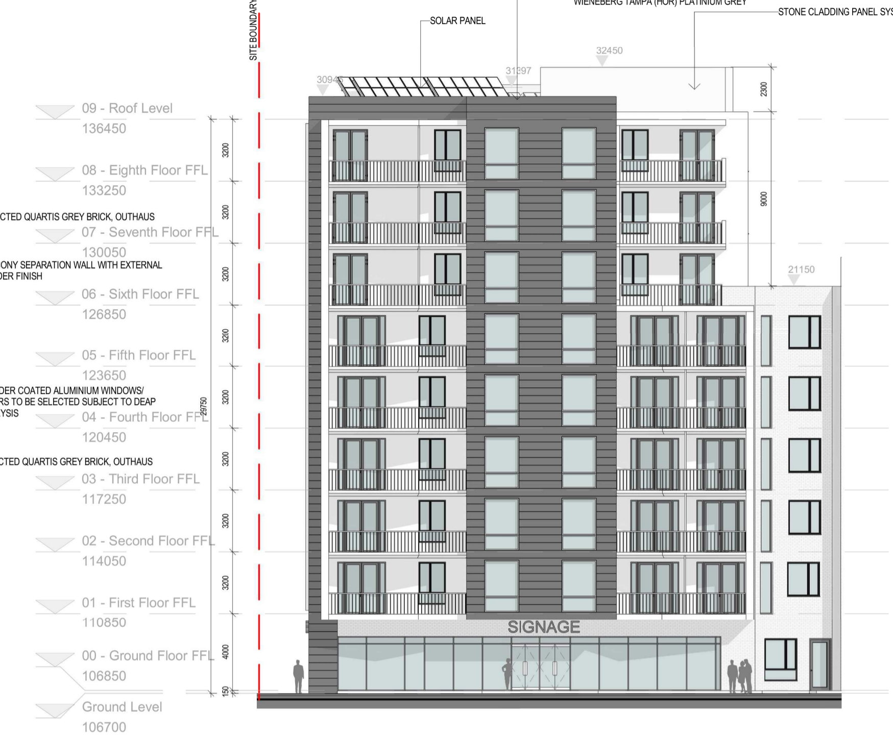
Block B - West Elevation (Consented) 1:200