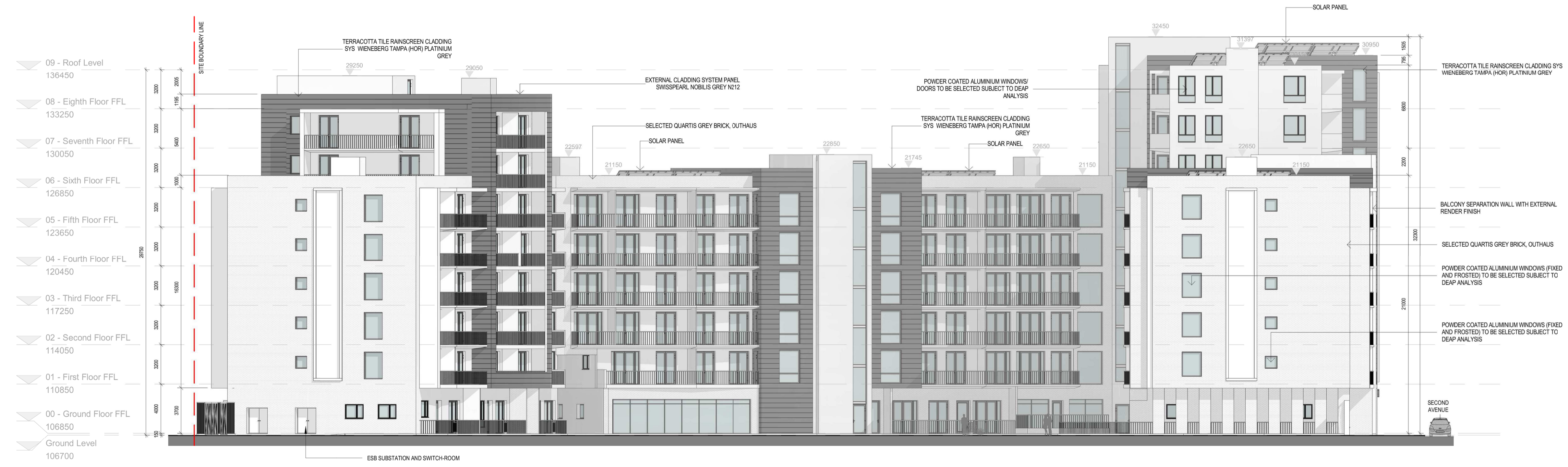
Block A, C & D - East Elevation (Consented) 1:200