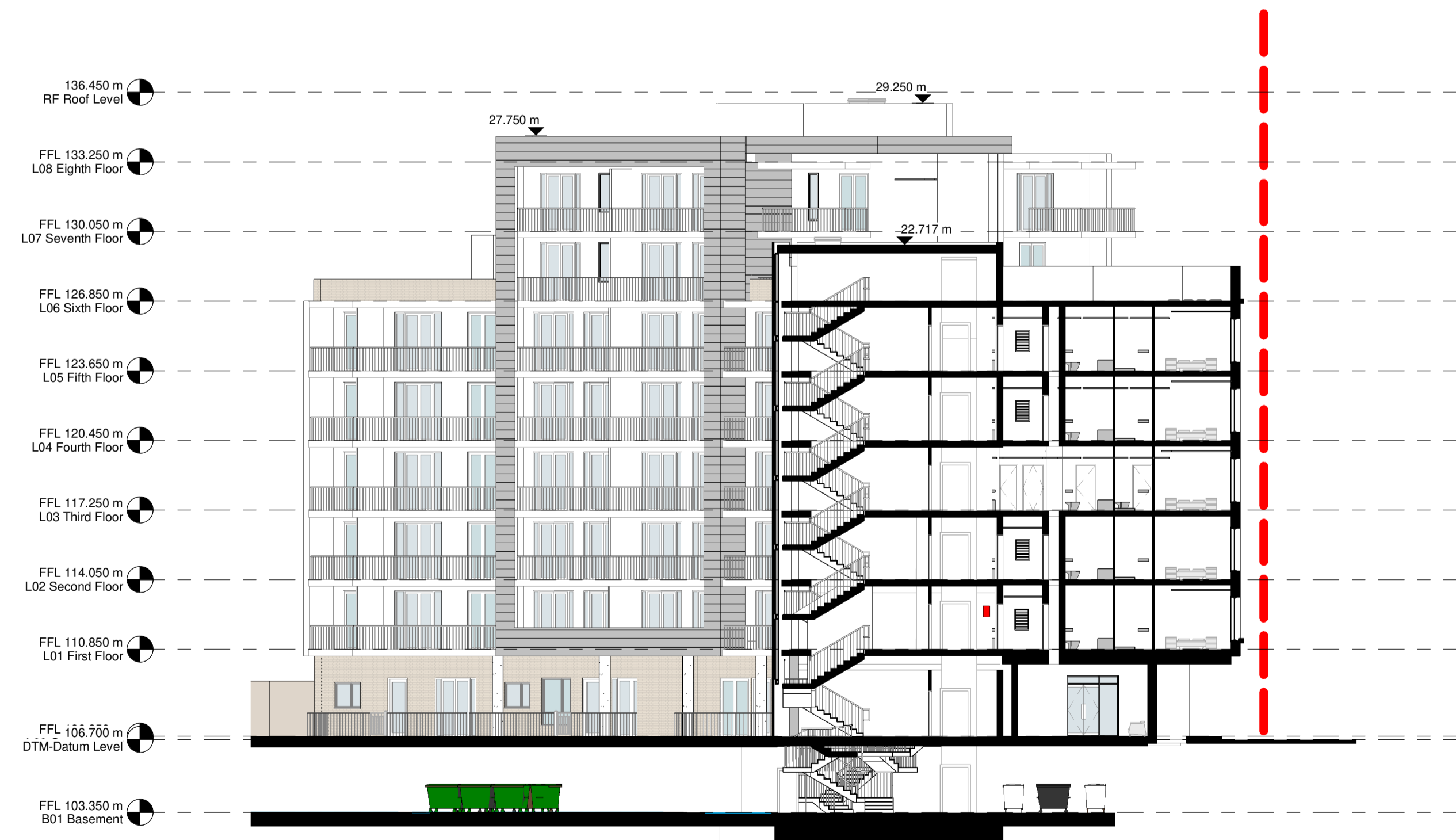
Proposed Section CC-1 1 : 200