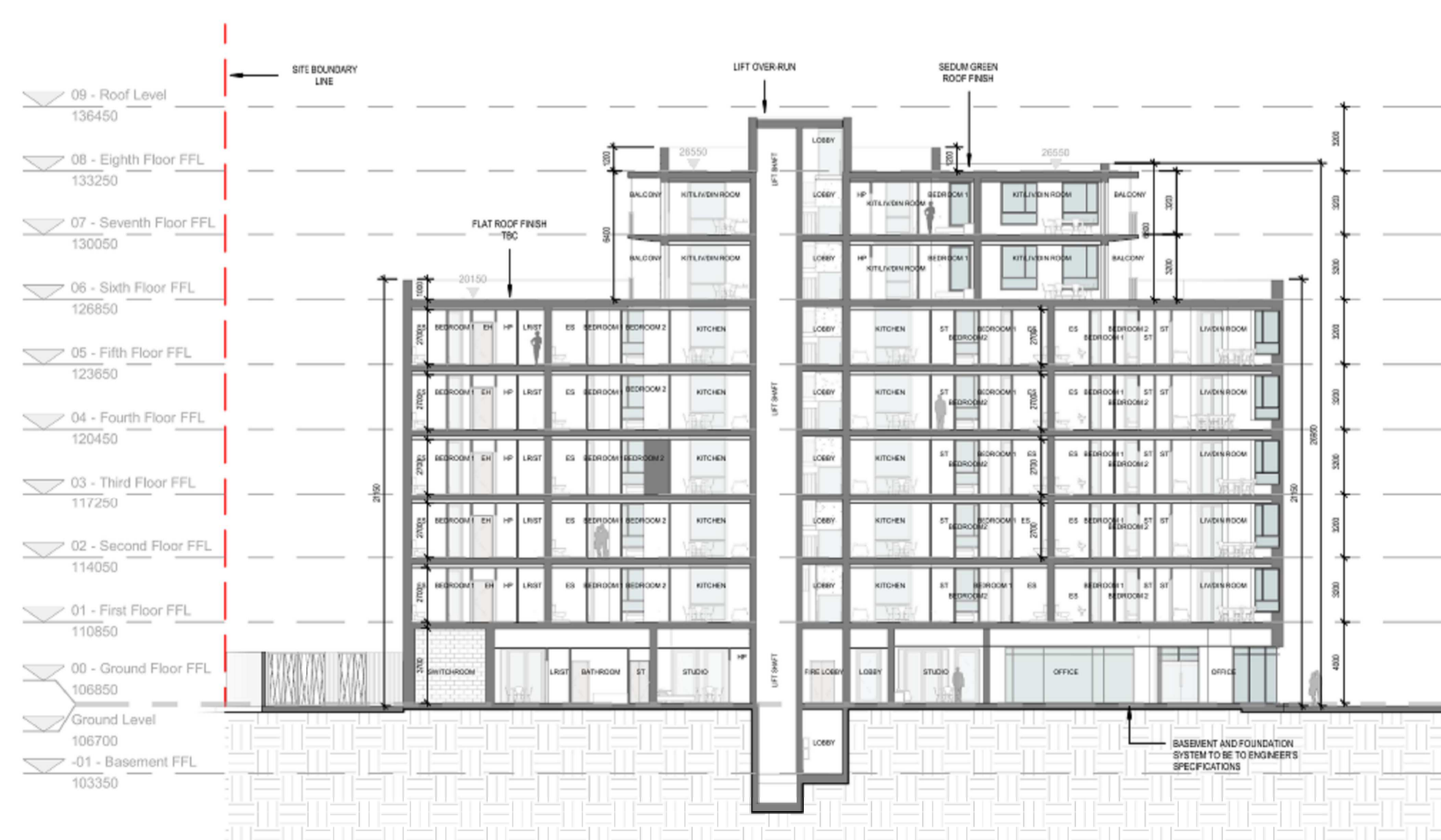
Section DD_CC (Consented) 1:200

Notes: - Do not scale from this drawing. Use figured dimensions in all cases. - Verify dimensions on site and report any discrepancies to the Architect immediately. - This drawing is to be read in conjunction with the Architect's Specification. - © This drawing is copyright and may only be reproduced with the Architect's permission.