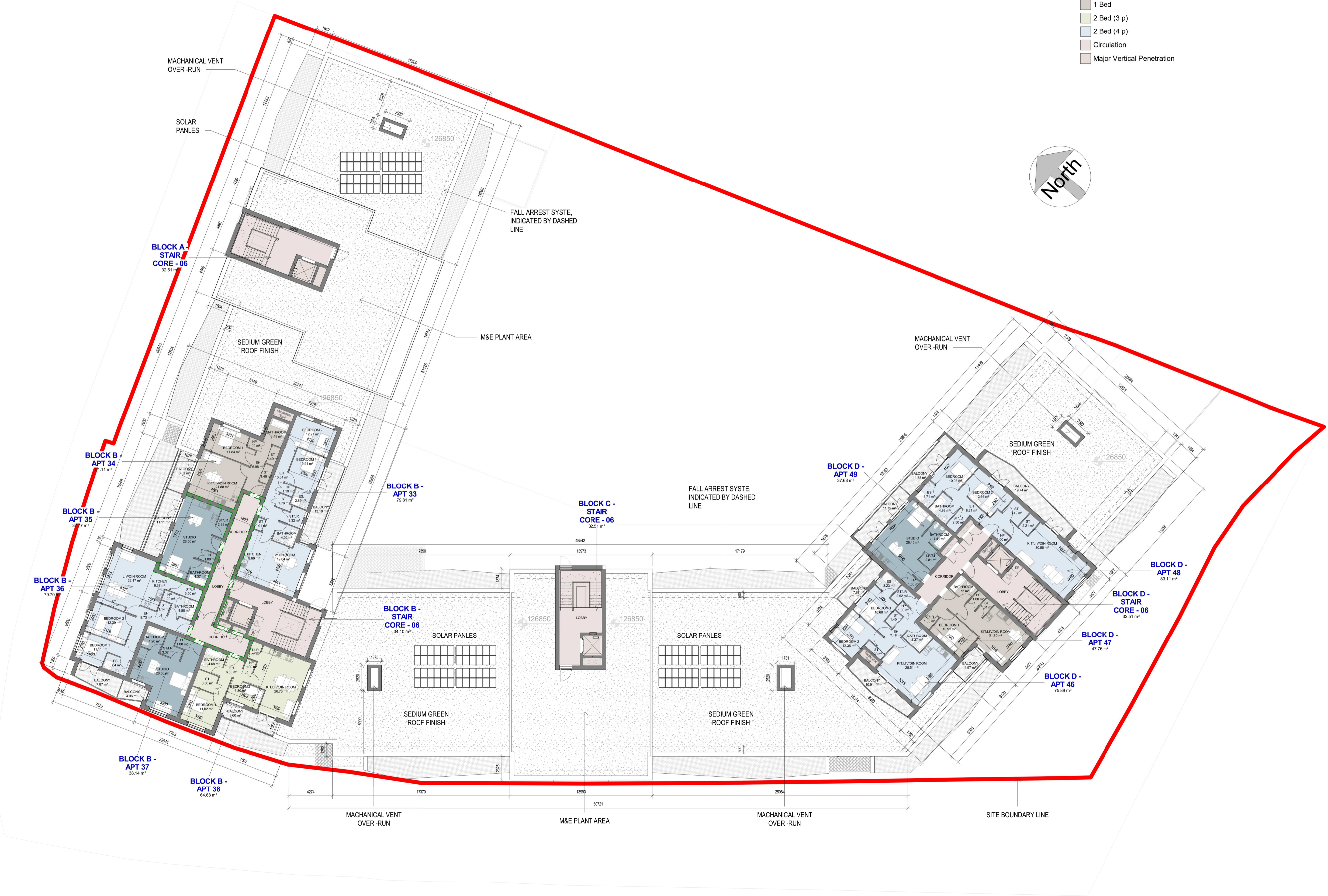
L06 Sixth Floor General Arrangement Plan (Consented) 1 : 200