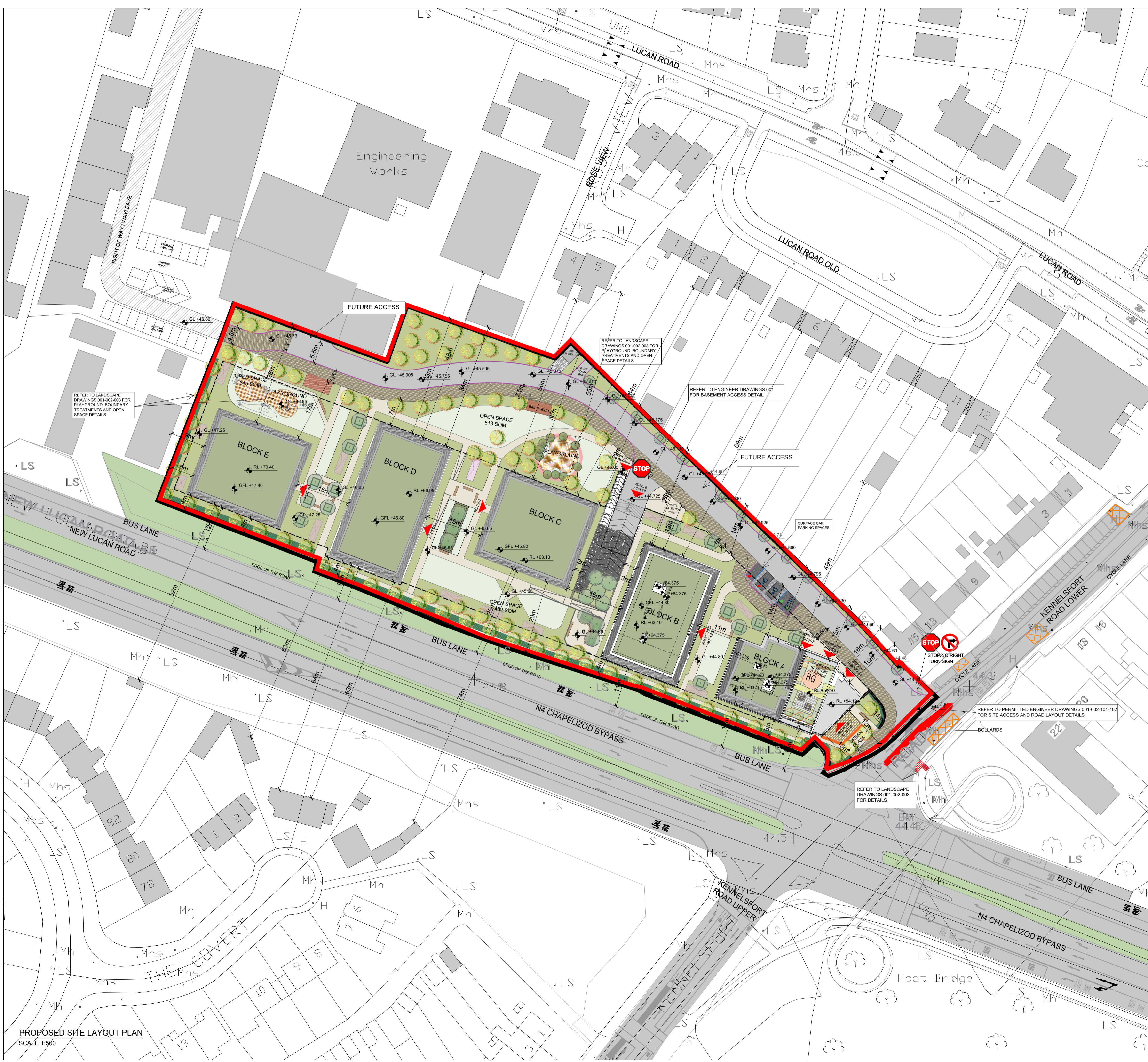
PROPOSED SITE LAYOUT PLAN SCALE 1:500