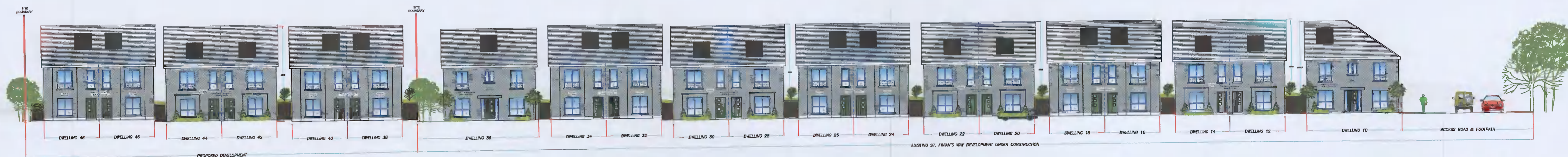
CONTIGUOUS ELEVATION A-A 1:200