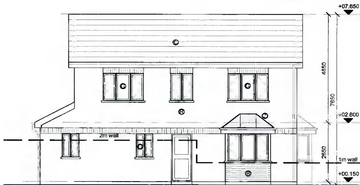
SIDE ELEVATION Scale: 1:100