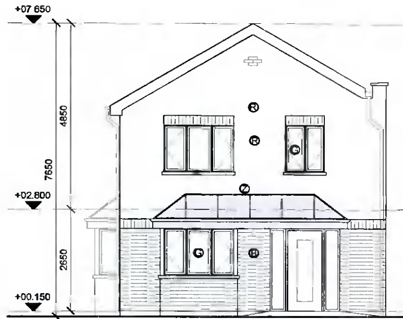
FRONT ELEVATION Scale: 1:100