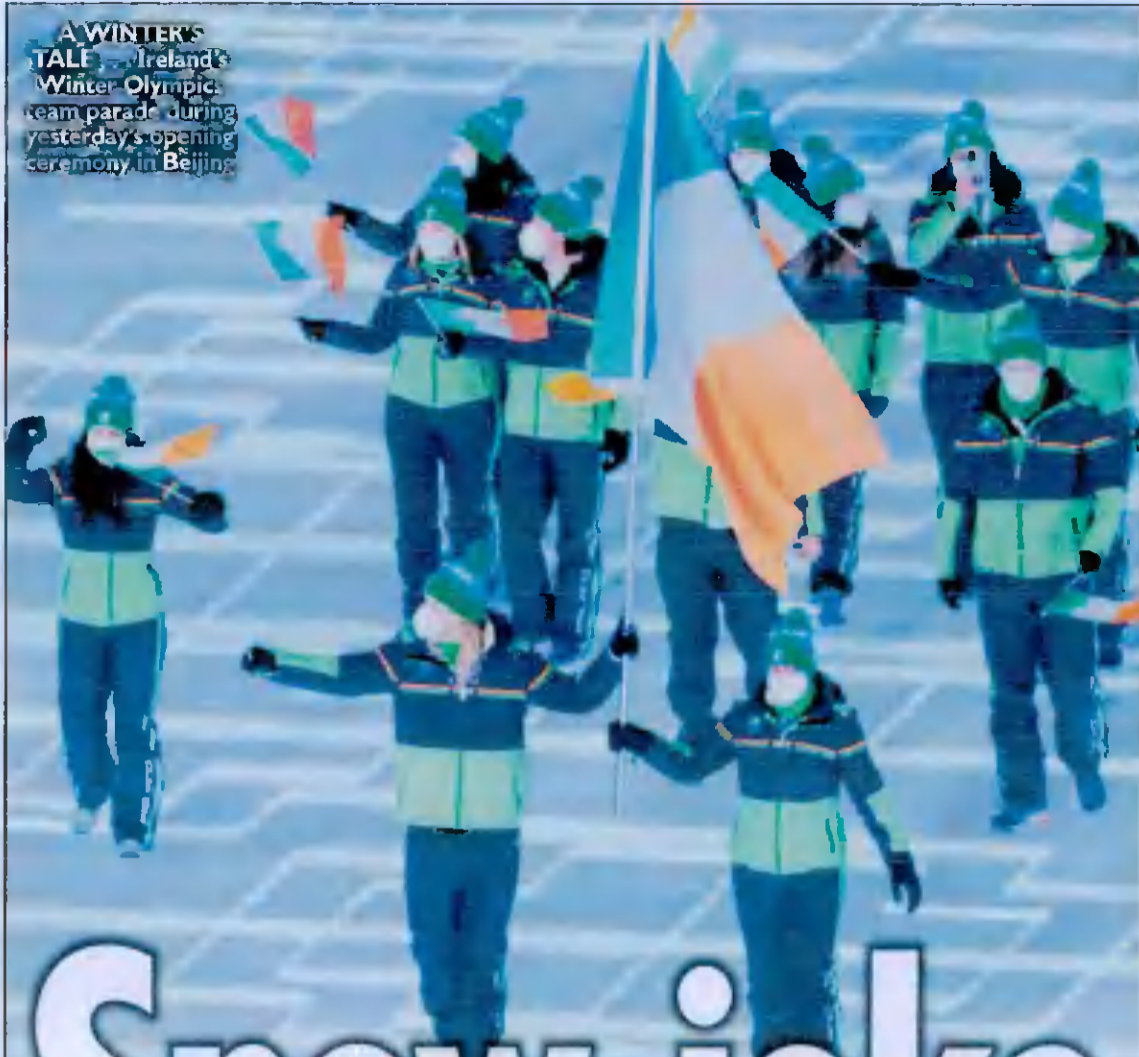
A WINTER'S TALE - Ireland's Winter Olympic team parade during yesterday's opening ceremony in Beijing