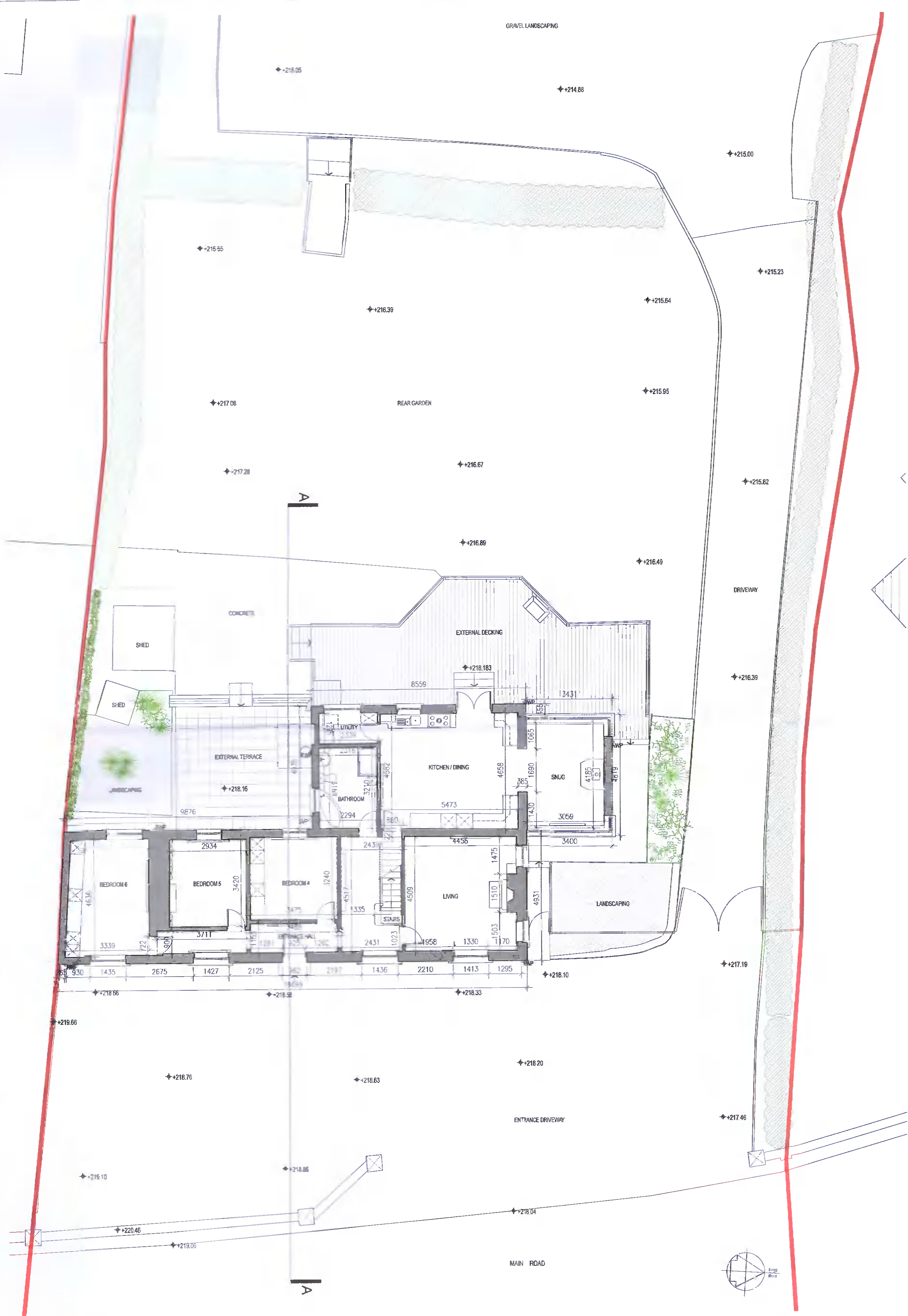
EXISTING GROUND FLOOR PLAN SCALE: 1:100