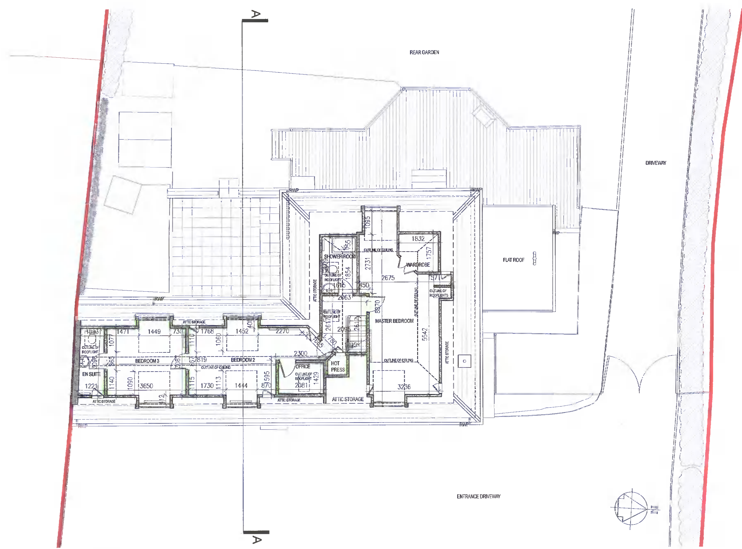
EXISTING FIRST FLOOR PLAN SCALE: 1:100