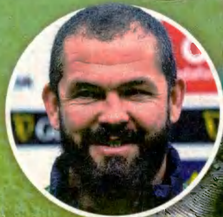
TAKE IT ANDY... Andrew Conway beats Josh Adams to score Ireland's second try and win plaudits from boss Andy Farrell (left)