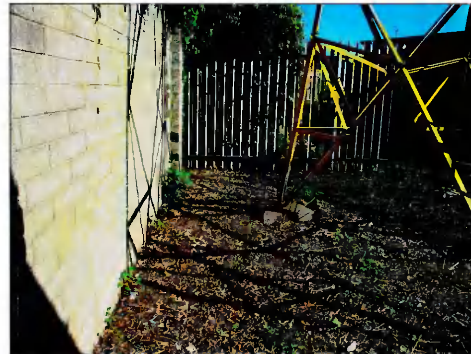
FIG 2. PROPOSED MONOPOLE LOCATION

ALL DIMENSIONS ARE IN mm UNLESS NOTED OTHERWISE