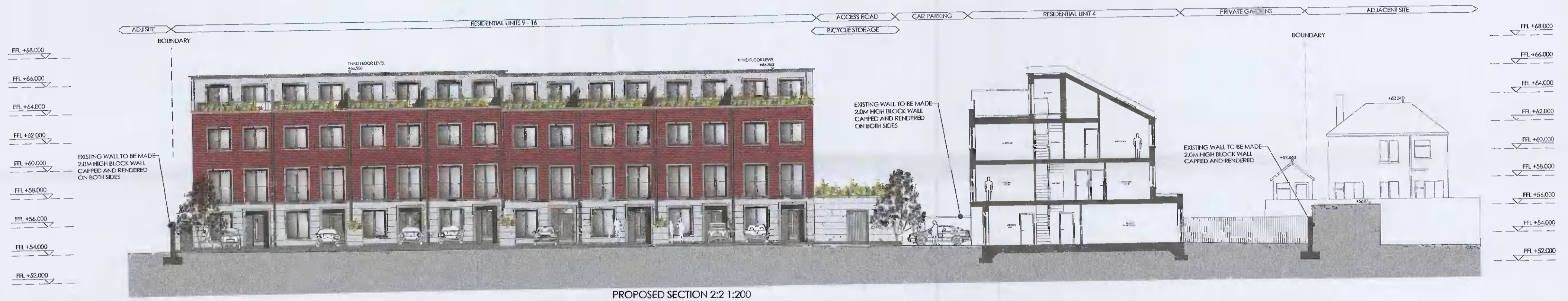
PROPOSED SECTION 2:2 1:200