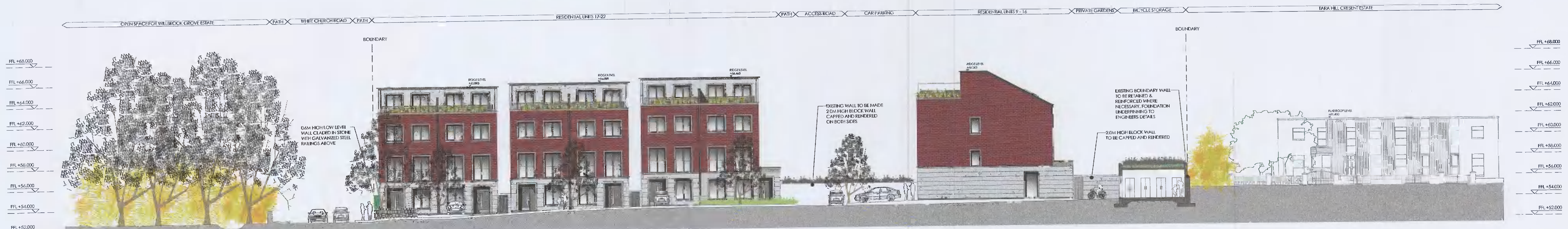
PROPOSED SECTION 3:3 1:200

DO NOT SCALE OFF THIS DRAWING. ONLY STATED DIMENSIONS ARE TO BE USED. ALL DIMENSIONS TO BE VERIFIED ON SITE BY MAIN CONTRACTOR BEFORE THE COMMENCEMENT OF WORKS. REPORT ALL DISCREPANCIES TO ARCHITECT IMMEDIATELY. THIS DRAWING IS TO BE READ WITH ALL RELATED ARCHITECTS AND ENGINEERS DRAWINGS AND OTHER RELEVANT INFORMATION. TITLE COPYRIGHT AND RIGHT TO USE THIS DOCUMENT RESERVED BY bba architecture. CONSTRUCTION SHOULD ONLY PROCEED FROM DRAWINGS ISSUED UNDER WORKING DRAWINGS (FOR CONSTRUCTION) STATUS, UNLESS PRIOR WRITTEN CONSENT IS GIVEN. SHOULD ANY SITE PERSONNEL, OR THOSE EMPLOYED TO CARRY OUT WORKS ON THEIR BEHALF, CHOOSE ALTERNATIVE MATERIALS OR COMPONENTS TO THOSE SPECIFIED BY bba architecture WITHOUT REFERENCE AND AGREEMENT WITH bba architecture, THEN THEY DO SO ENTIRELY AT THEIR OWN RISK.