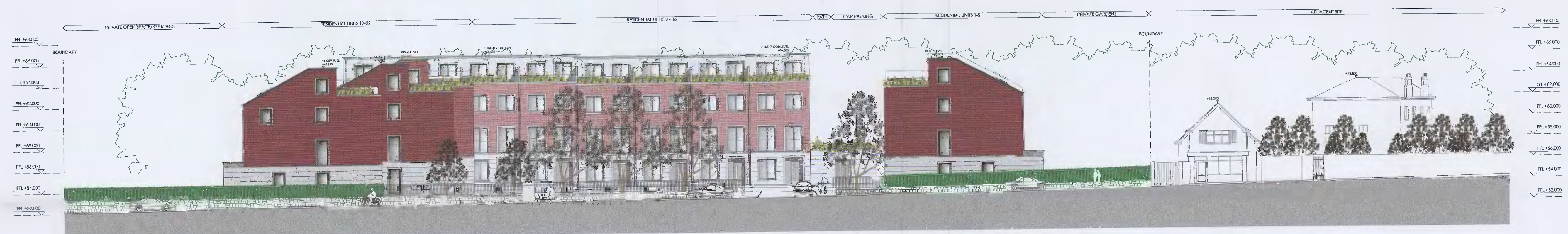
PROPOSED SECTION 1:1 1:200