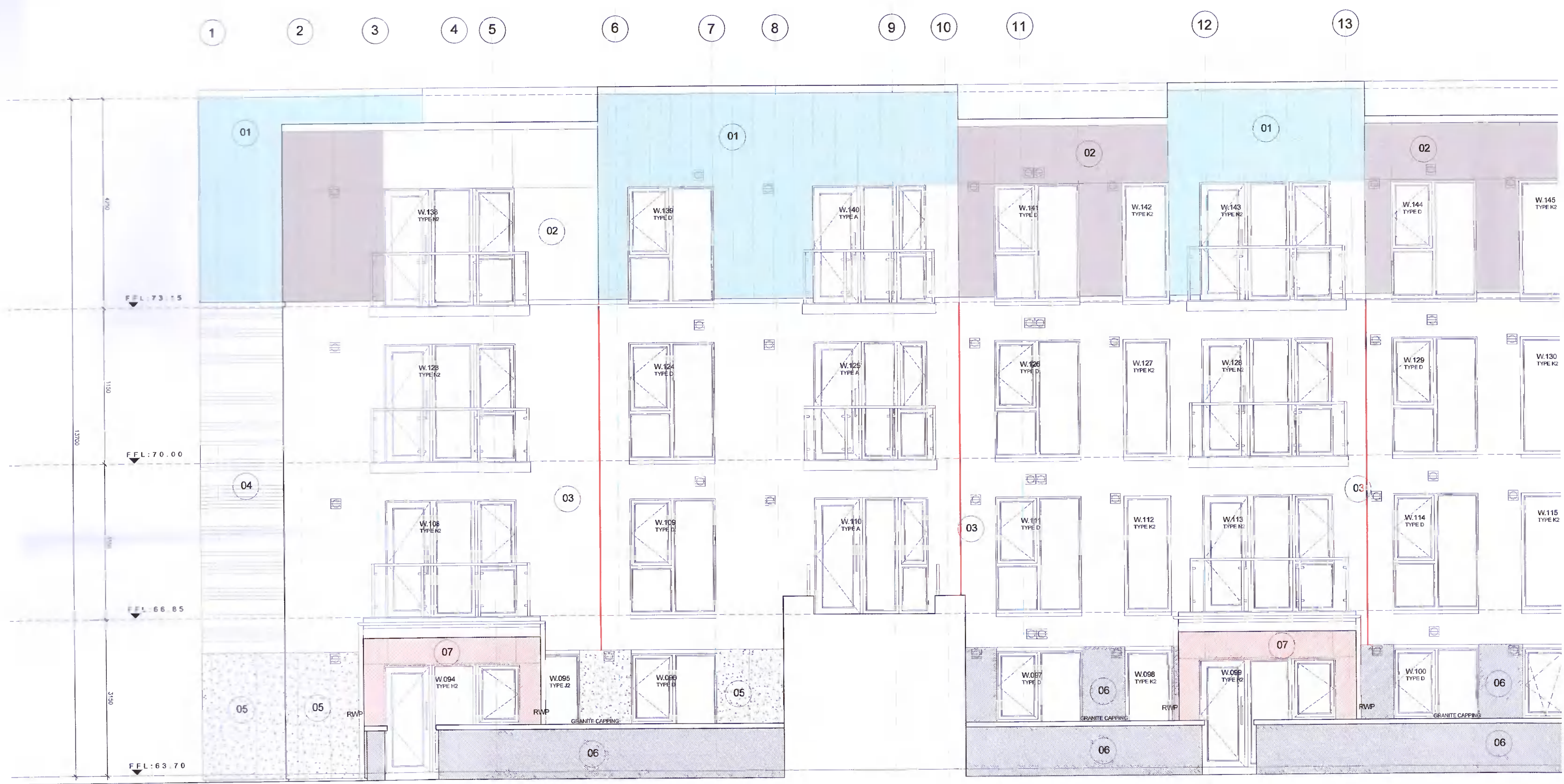
BLOCK A NORTH WEST ELEVATION 2/2 ALL ELEVATIONS ARE SUBJECT TO CHANGE BASED ON DETAILED FACADE DESIGN AND THE INPUT OF OTHER DESIGN TEAM MEMBERS.

ALL ELEVATIONS REQUIRE APPROVAL FROM THE PLANNING AUTHORITY PRIOR TO CONSTRUCTION.