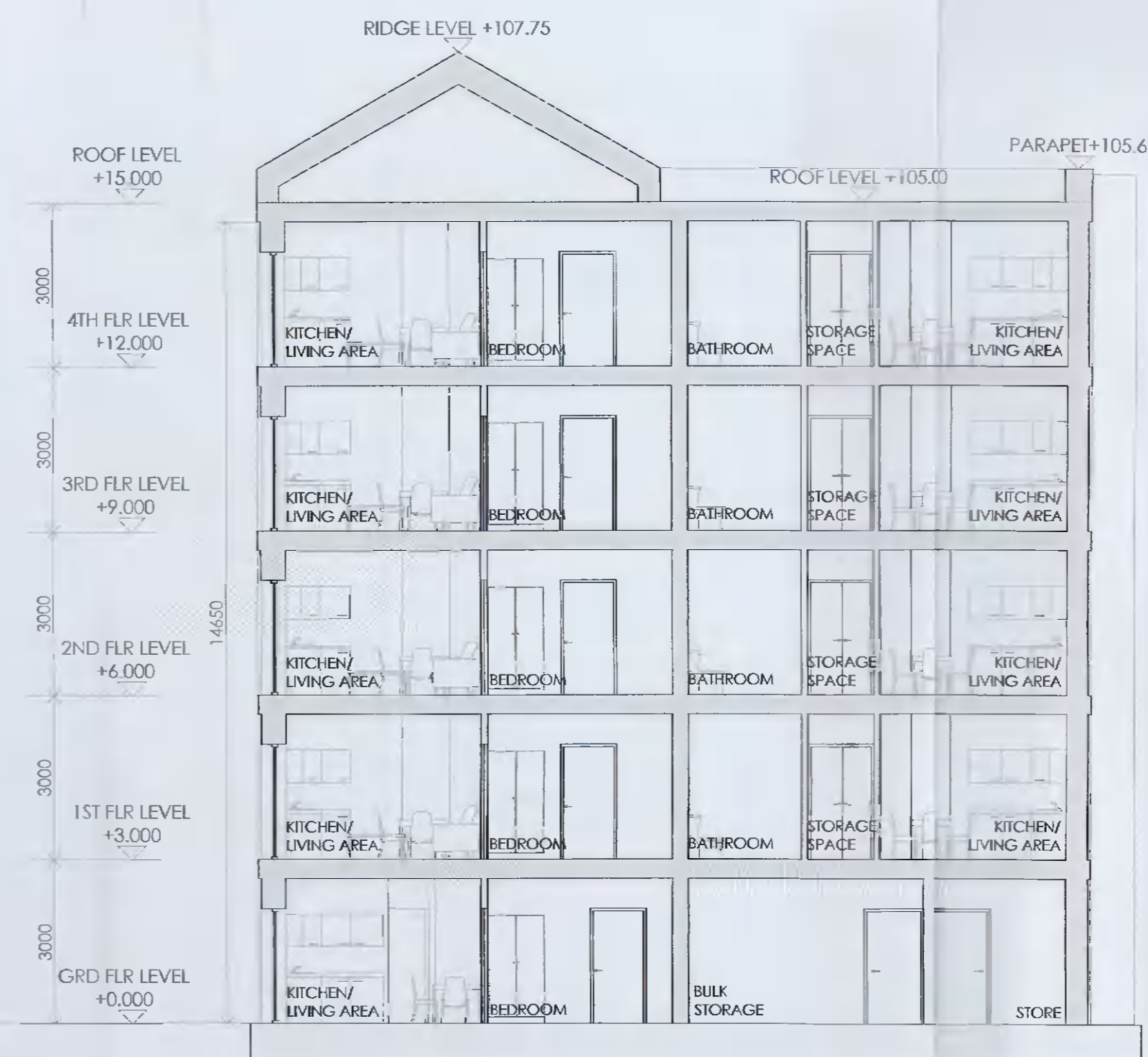
BLOCK C SECTION F-F SCALE 1:100