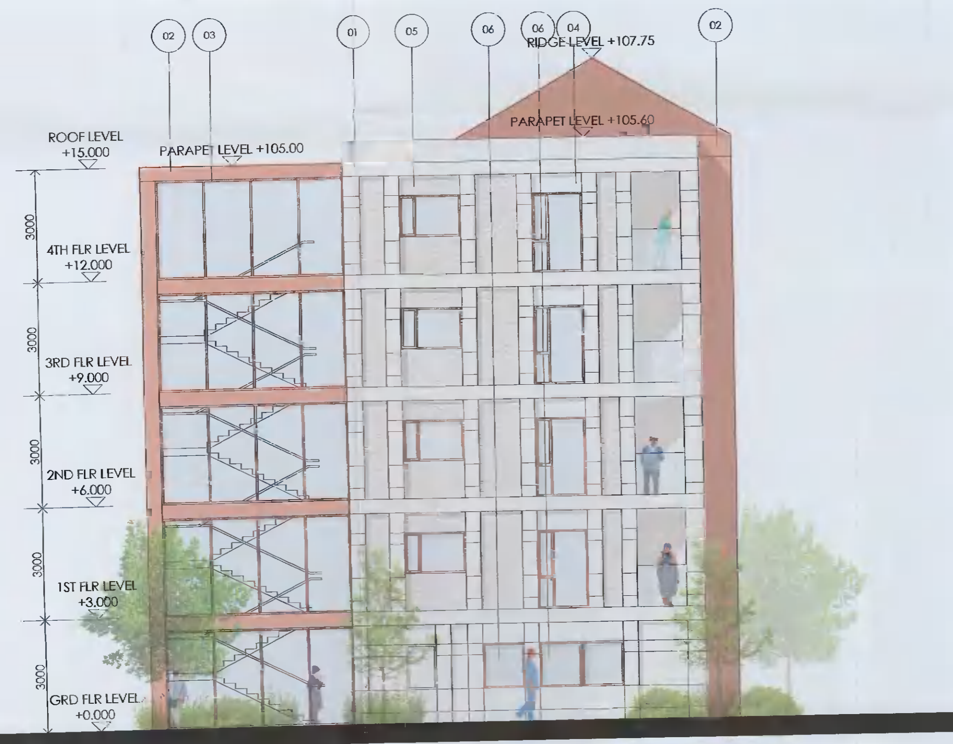
BLOCK C WEST ELEVATION SCALE 1:100 5452.5 15972.5 9655 865