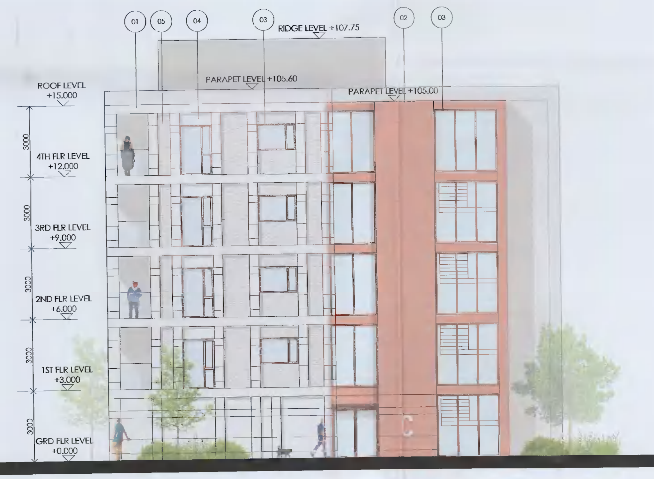
BLOCK C NORTH ELEVATION SCALE 1:100 9552.5 19480 2000 5655 2272.5