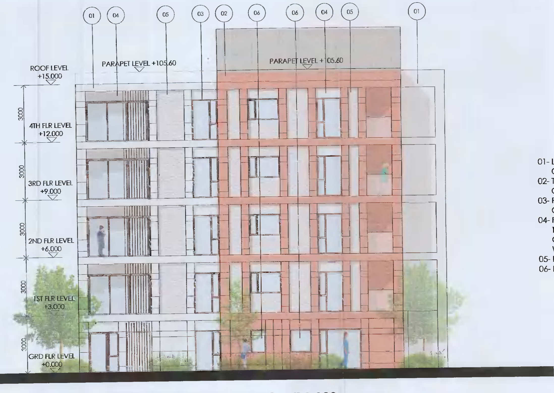
BLOCK C SOUTH ELEVATION SCALE 1:100 7425 19480 9655 2400