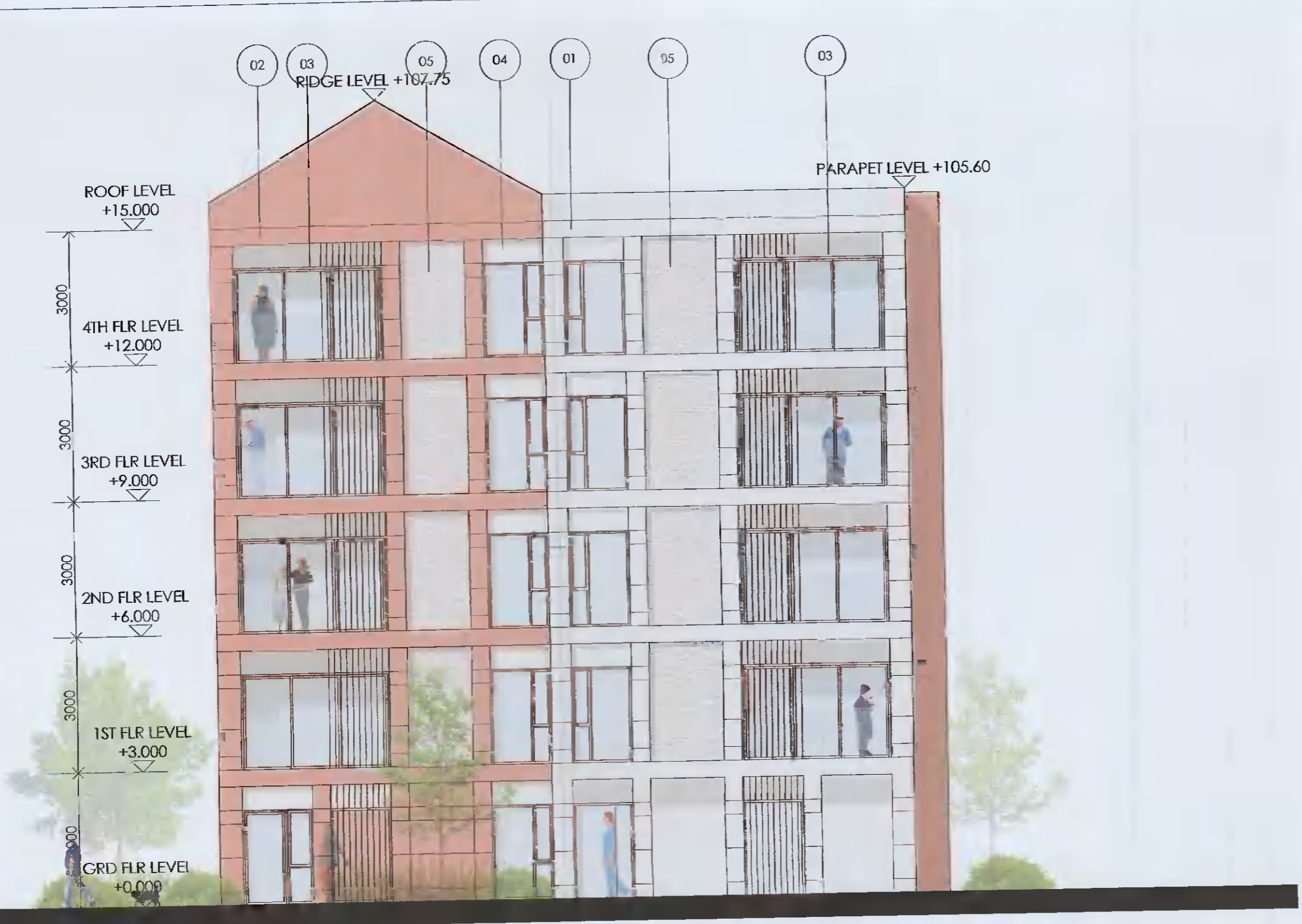
BLOCK C EAST ELEVATION SCALE 1:100 7425 15972.5 8130 117.5