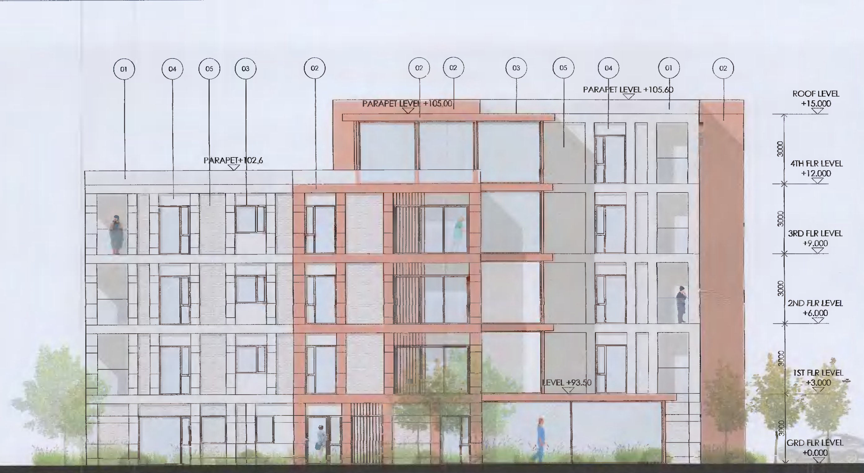
BLOCK B SOUTH ELEVATION SCALE 1:100