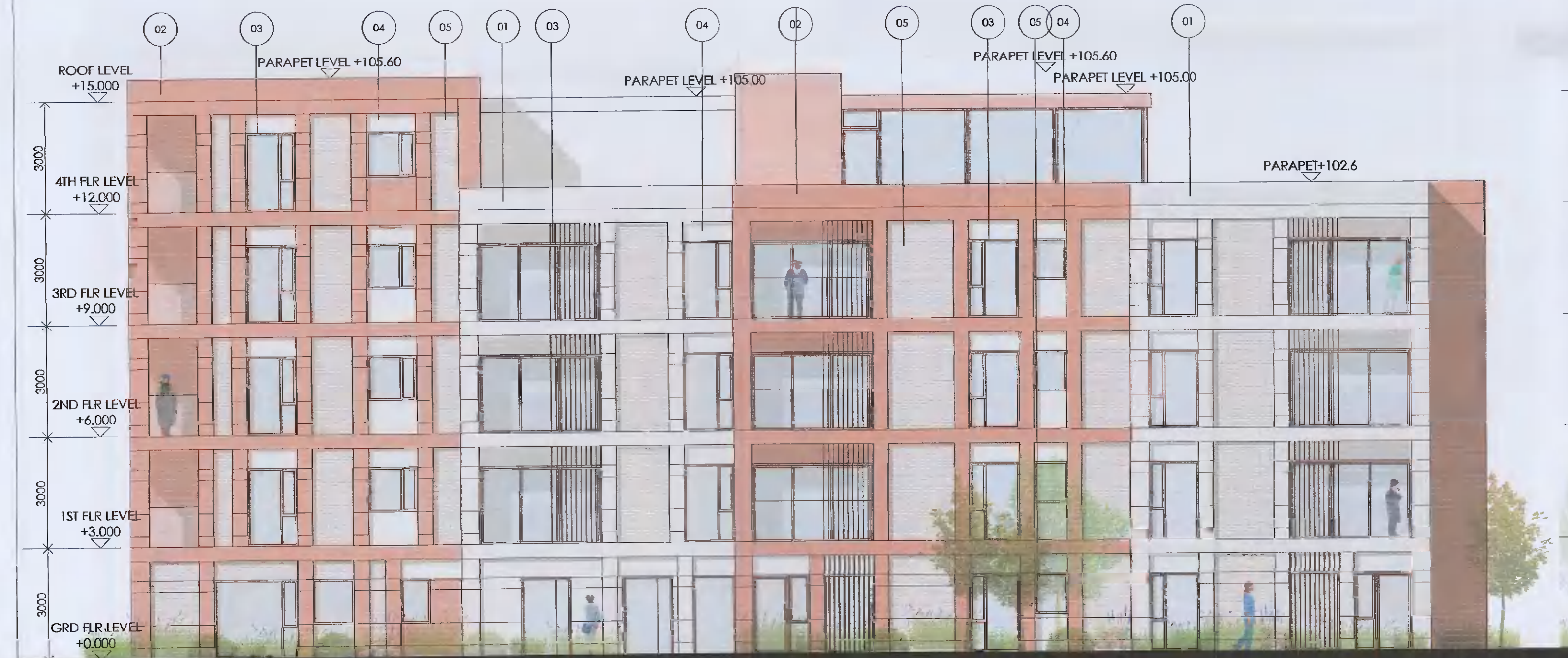
BLOCK B WEST ELEVATION SCALE 1:100