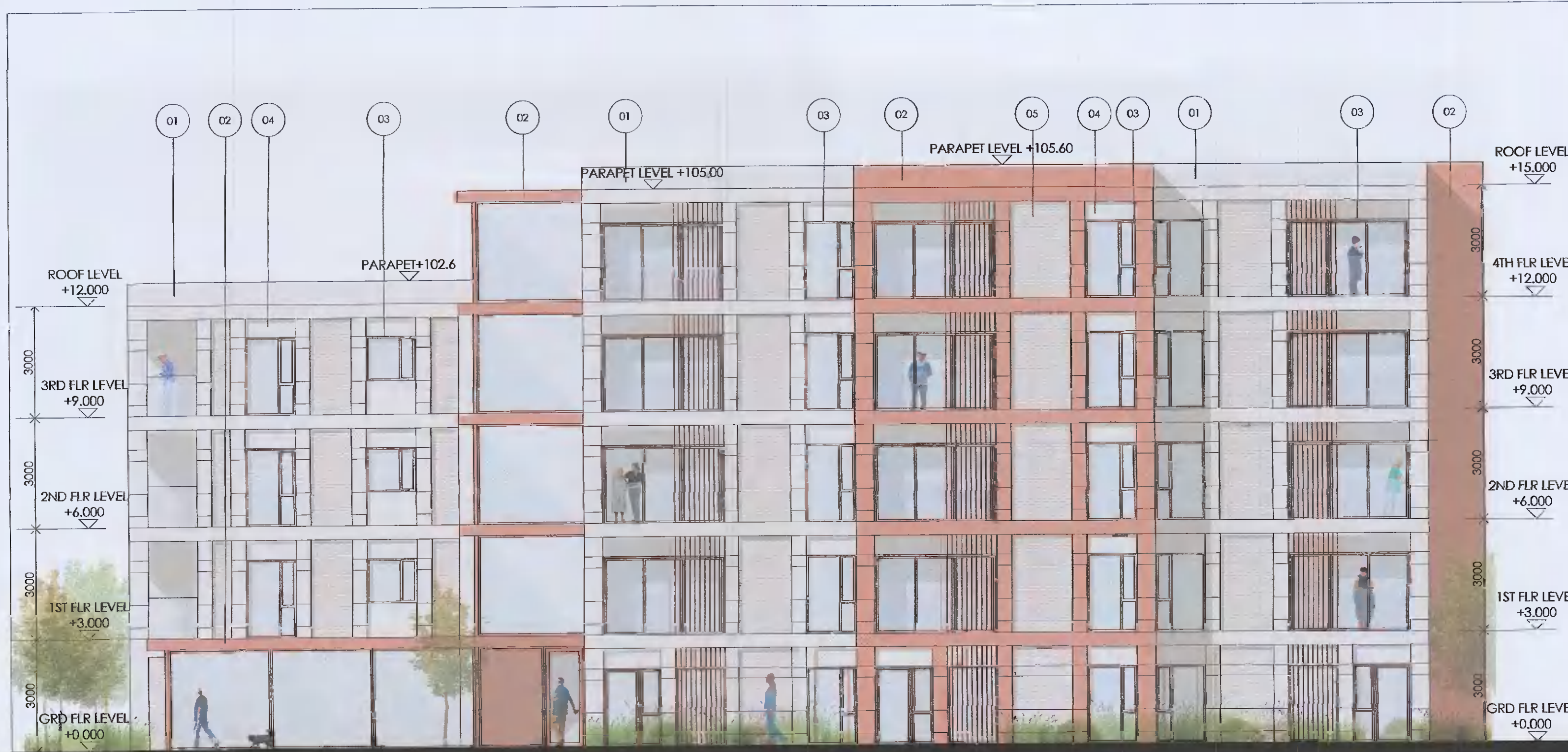
BLOCK B EAST ELEVATION SCALE 1:100