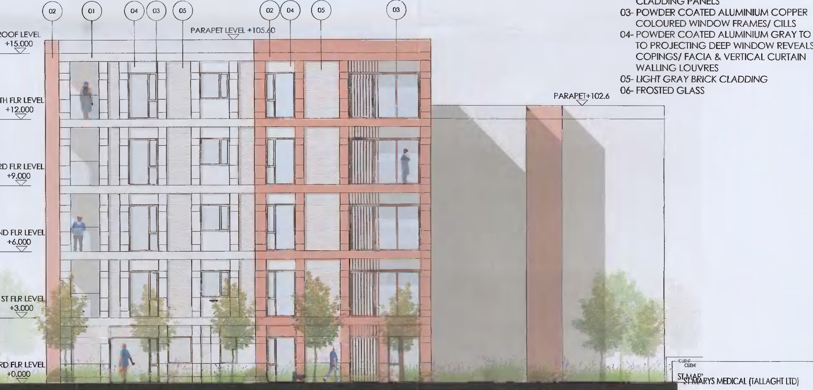
BLOCK B NORTH ELEVATION SCALE 1:100