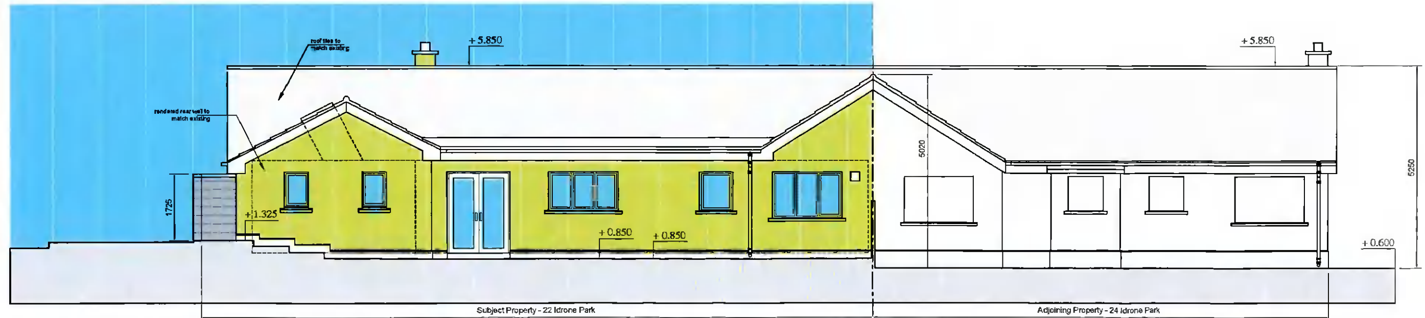
Rear Contextual Elevation -- Proposed Scale: 1/100