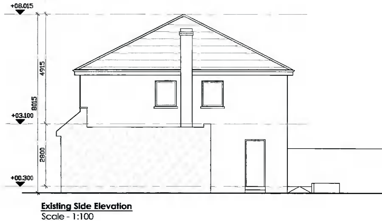
Existing Side Elevation Scale - 1:100