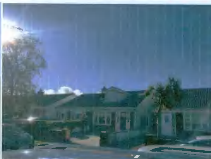
9 Parkhill Heights