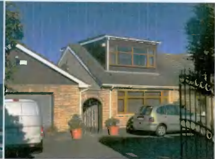
159 Greenhills Road