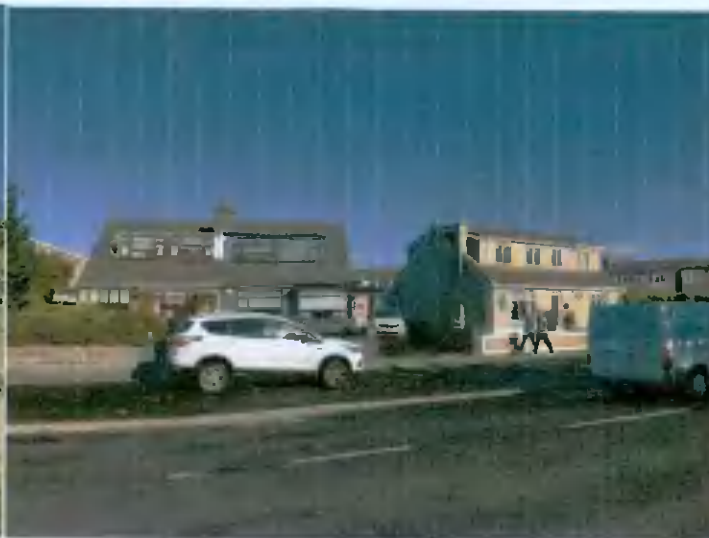
2 Limeklin Park