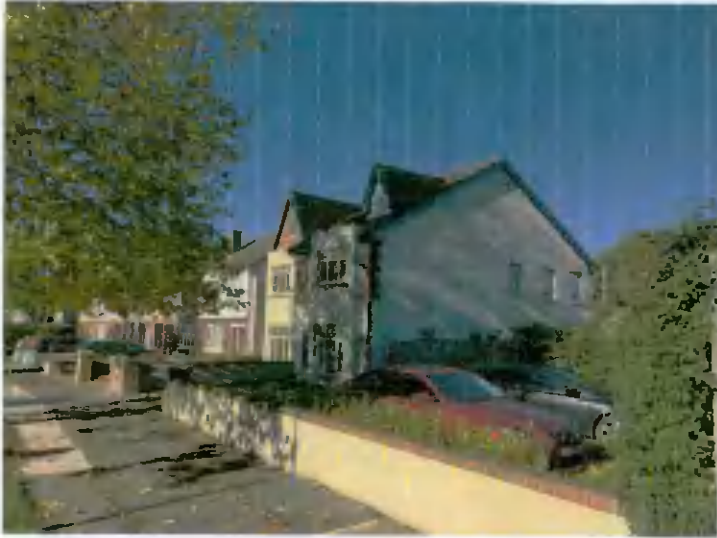
70 Limeklin Road