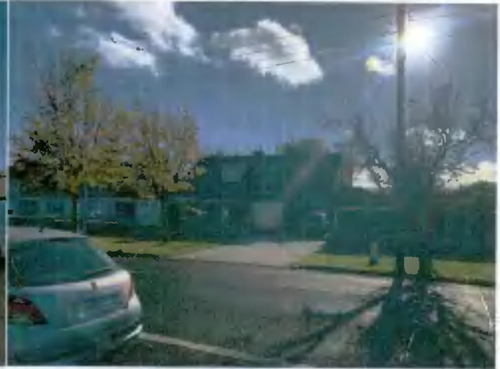
62 Limeklin Road