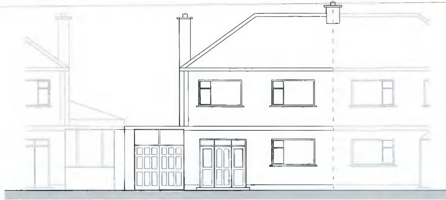
Existing NNW Elevation Scale 1 : 100