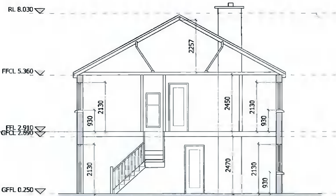
Existing Section A- A Scale 1 : 100