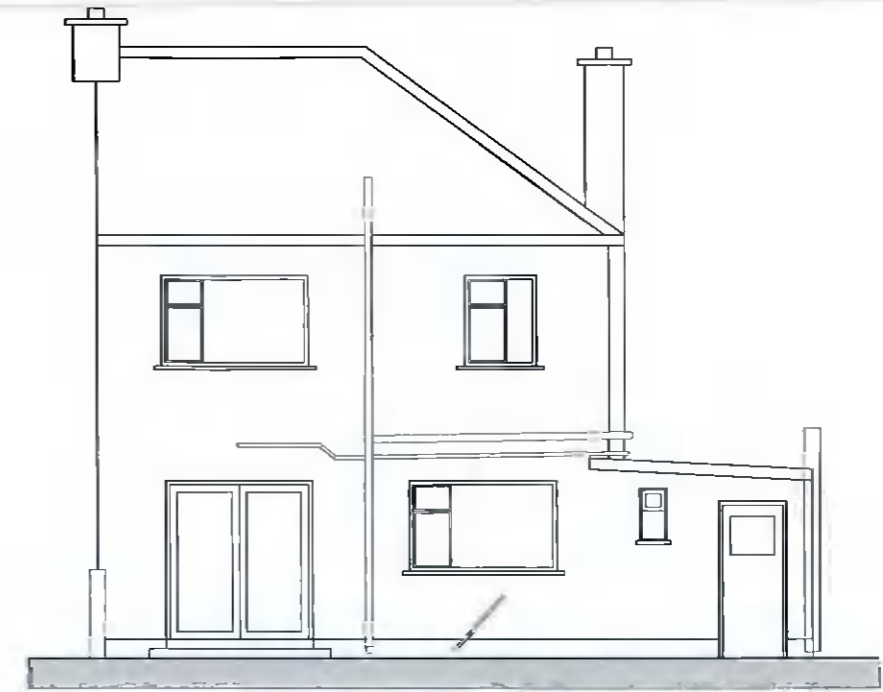
Existing SSE Elevation Scale 1 : 100