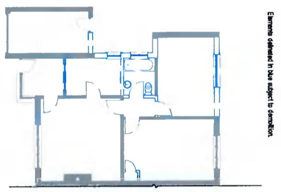
4 Level 0 Ground Floor Demolition 1 : 200