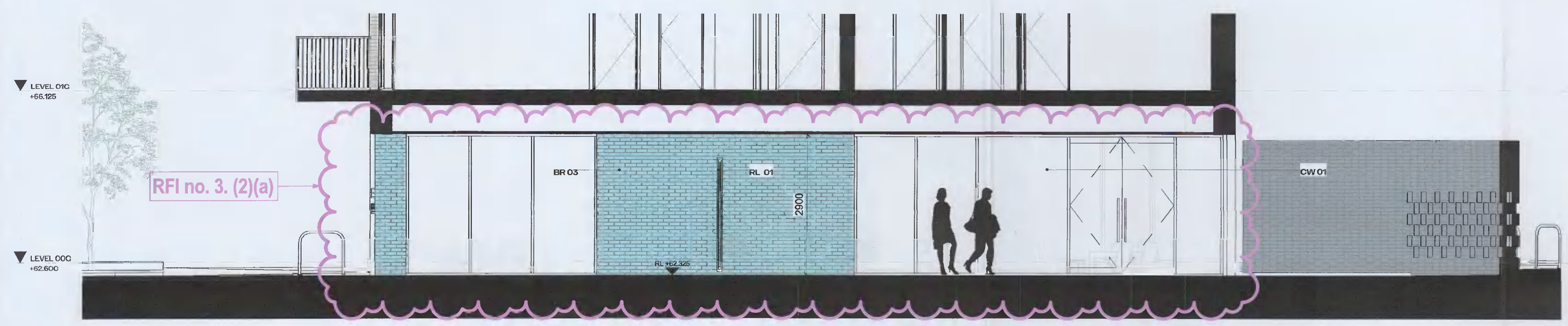
B East-West Pedestrian Access - Section B-B 1:50

Henry J Lyons Architecture + Interiors +353 1 888 3333 info@henryjlyons.com 51-54 Pearse Street Dublin D02 KA66