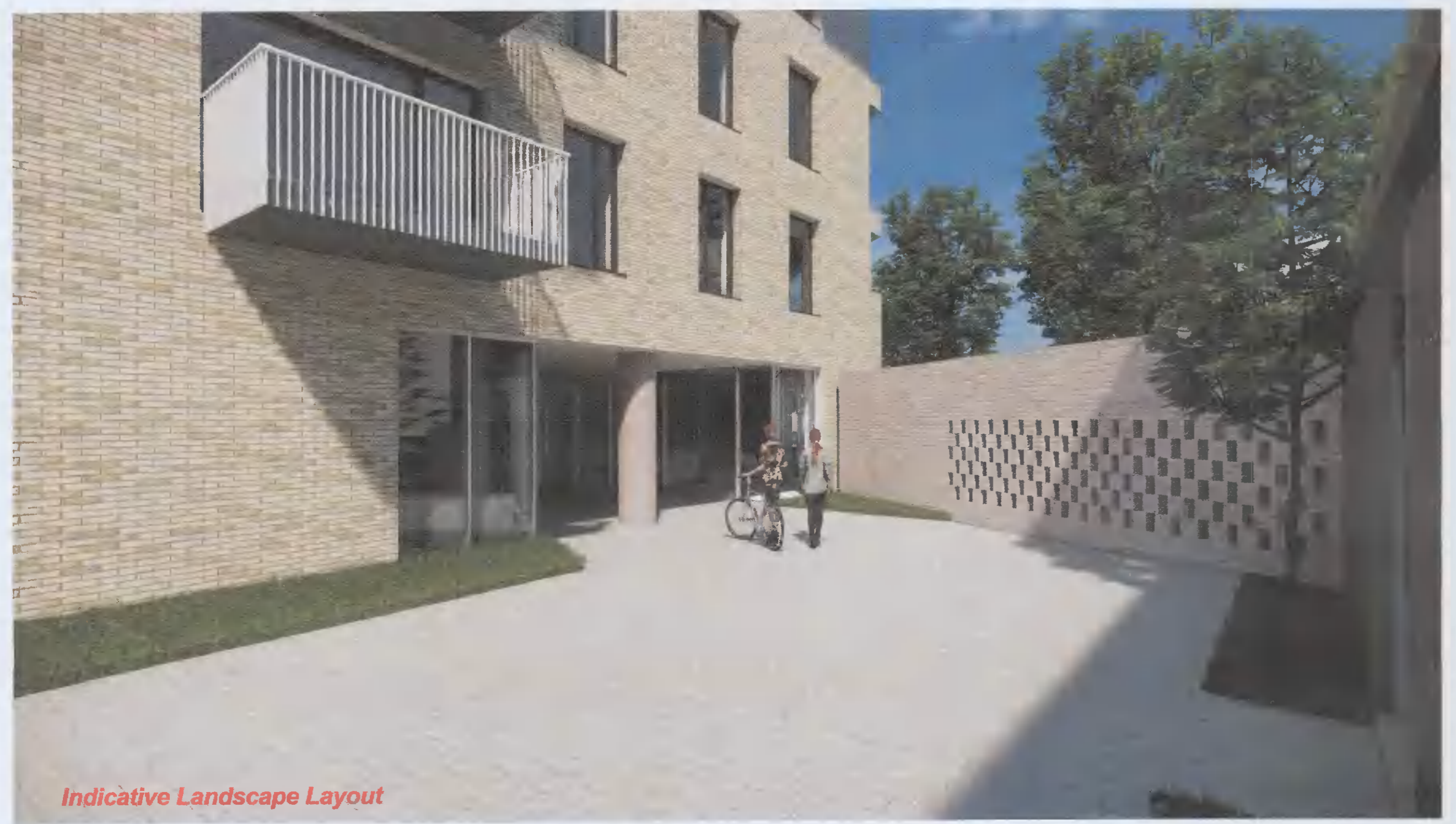
East-West Pedestrian Access - Approach from Communal Open Space