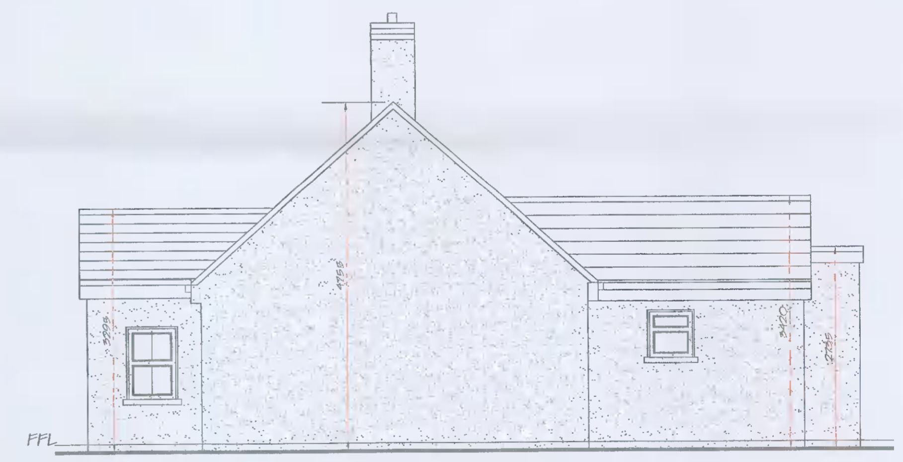
SIDE ELEVATION. Survey Drawing (Scale 1:50mm)

Office Opening Hours: Monday-Friday 8.30am to 5.30pm