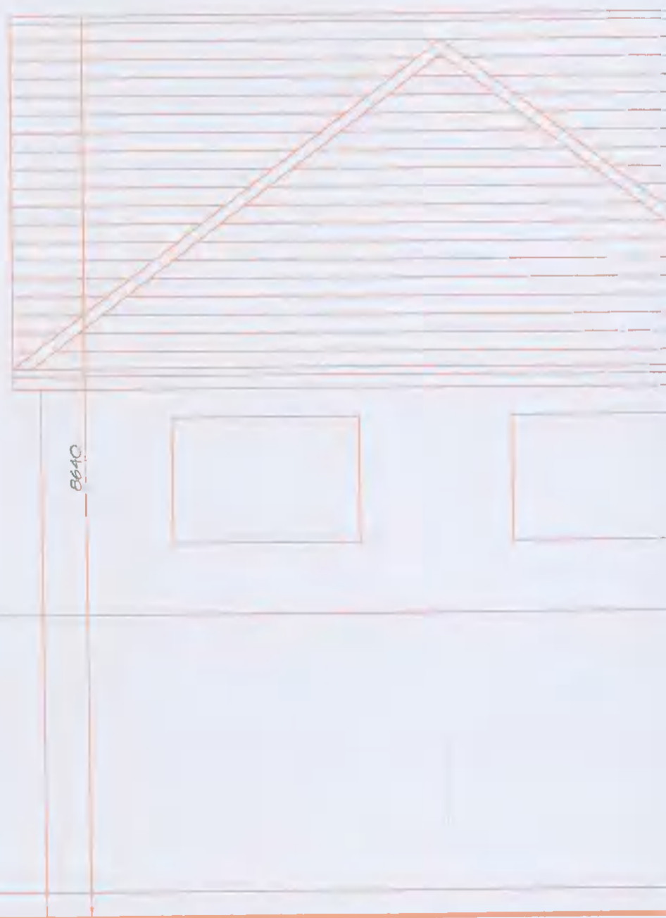
SEANCHLOS FRONT ELEVATION, Neighboring Structure (Scale 1:50mm) Survey Drawing.