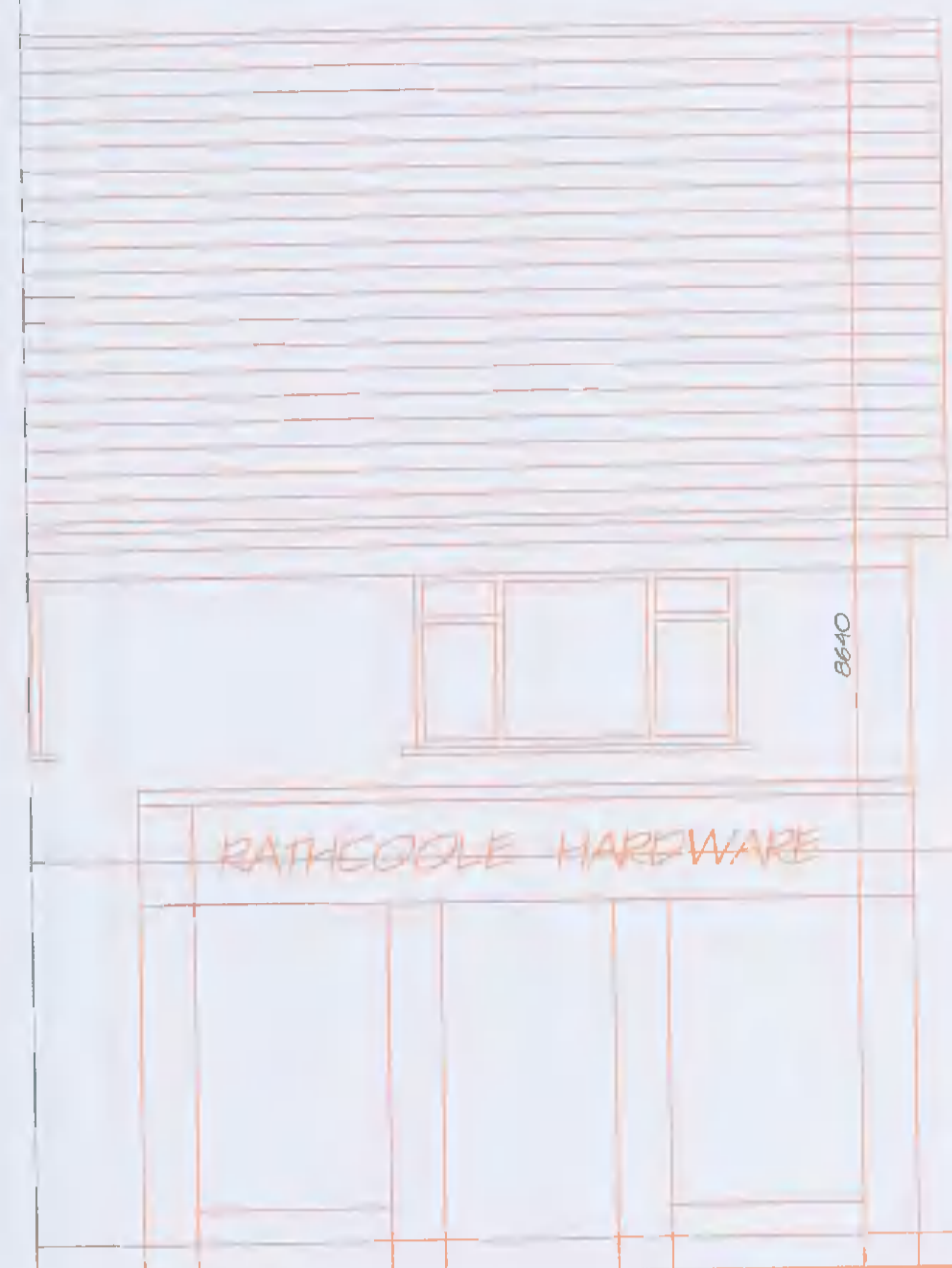
RATHCOOLE HARDWARE FRONT ELEVATION, Neighboring Structure Survey Drawing. (Scale 1:50mm)

© This Drawing is Copyright. Do not scale - Use figured dimensions only. Any discrepancies should be immediately brought to the attention of the design consultants.