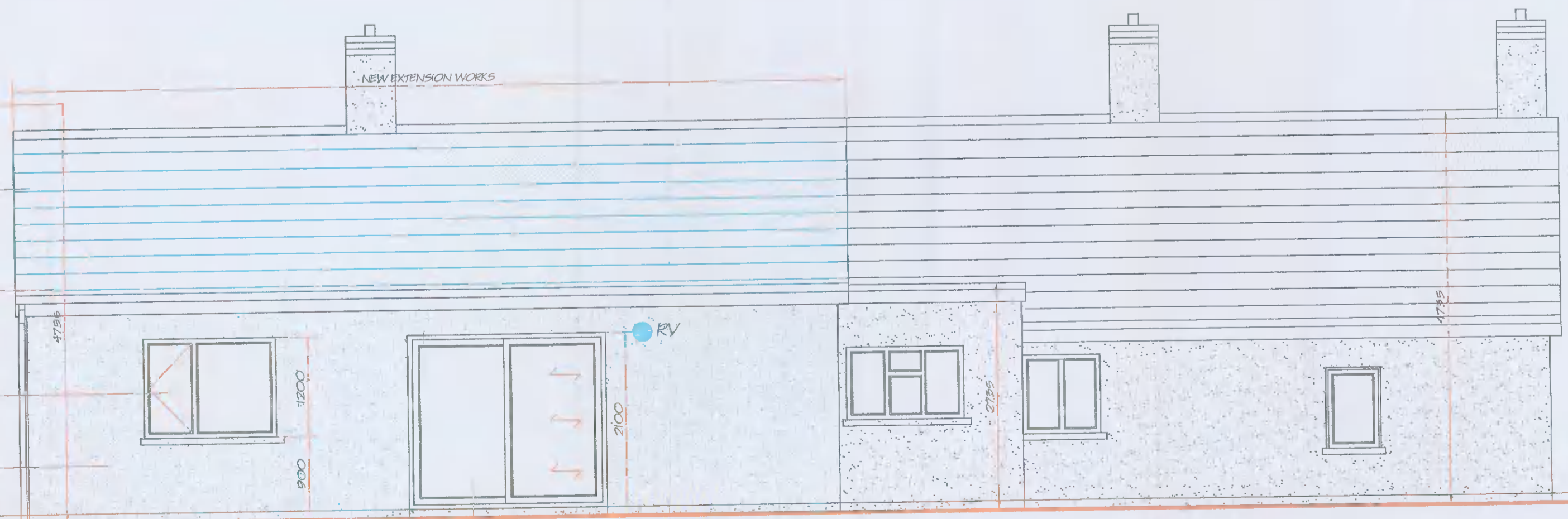
REAR ELEVATION. Proposed Drawing (Scale 1:50mm)