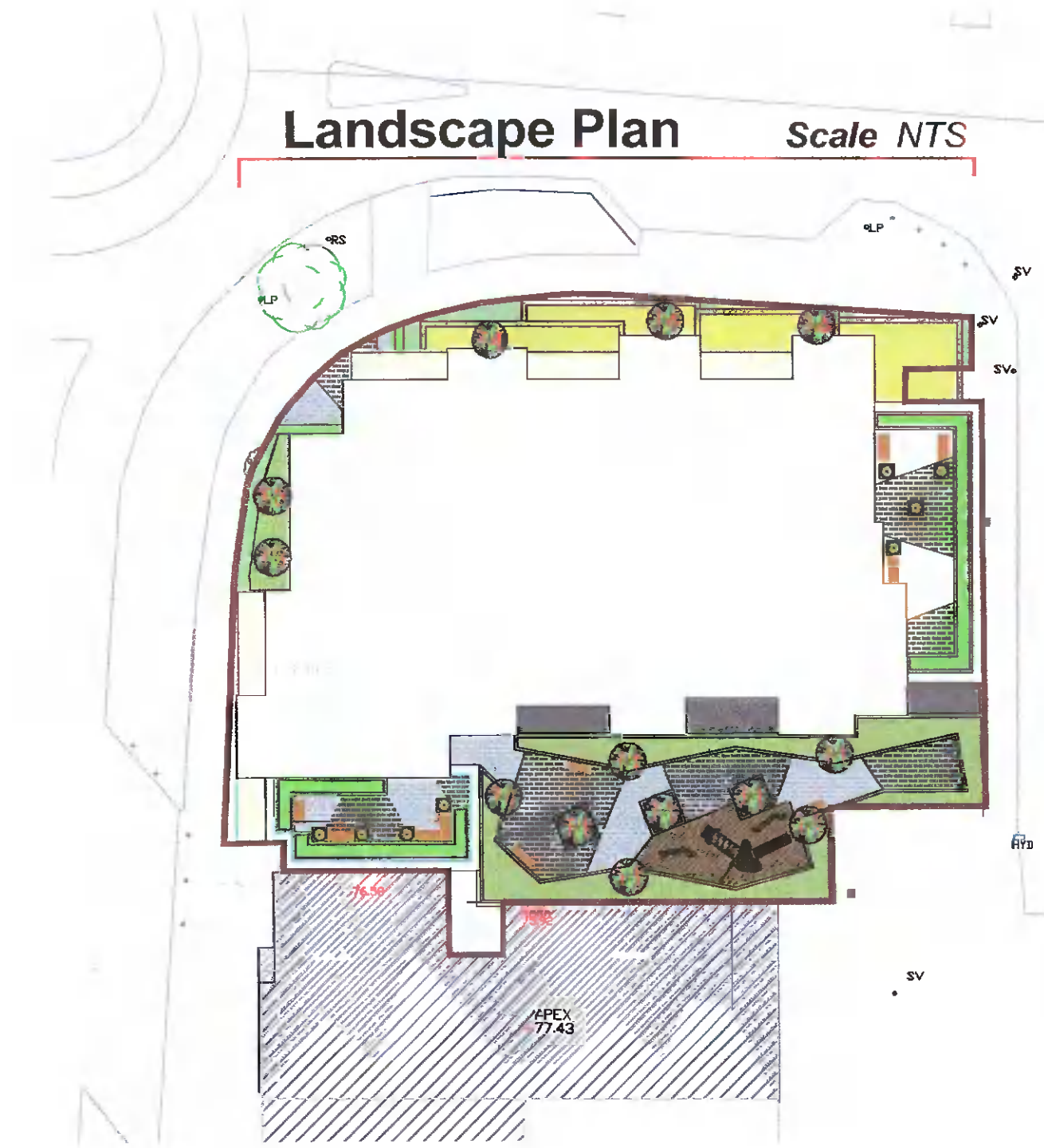
Landscape Plan Scale NTS