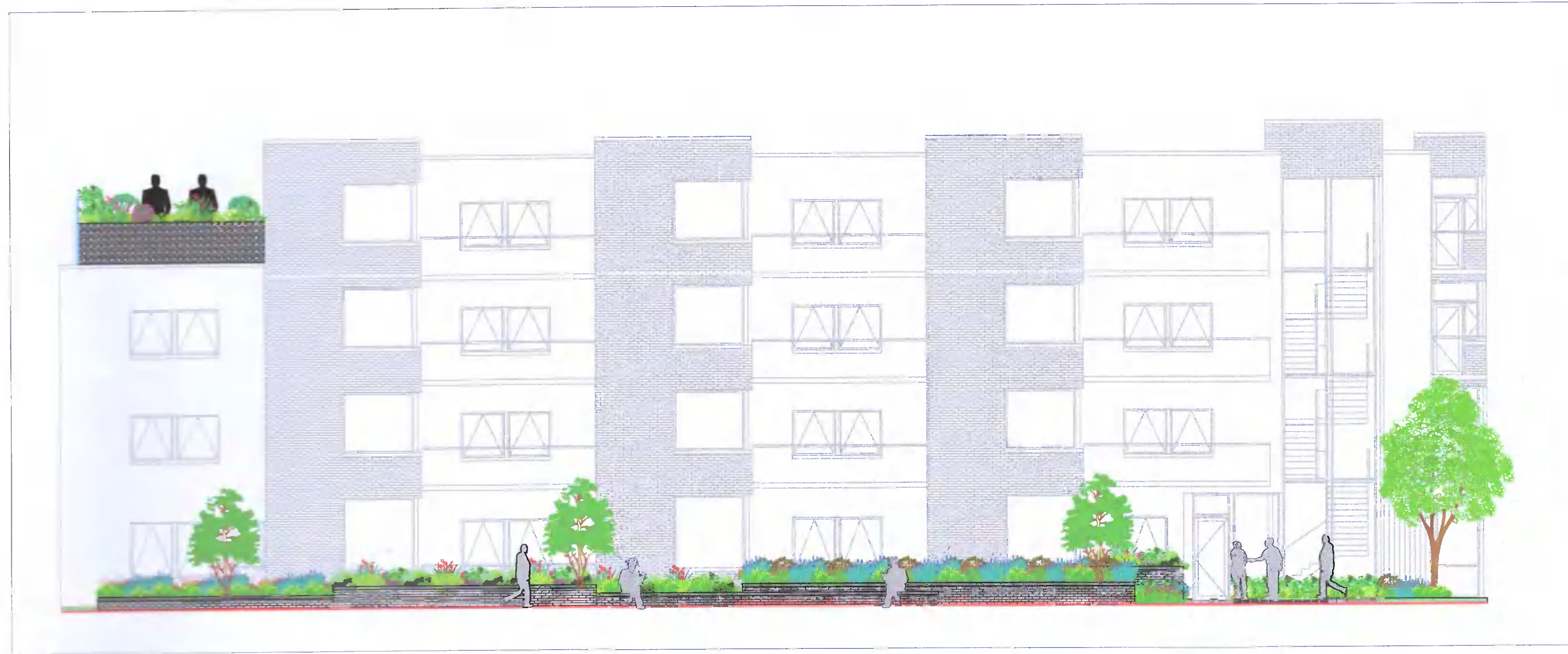
Northern Elevation Scale 1:100