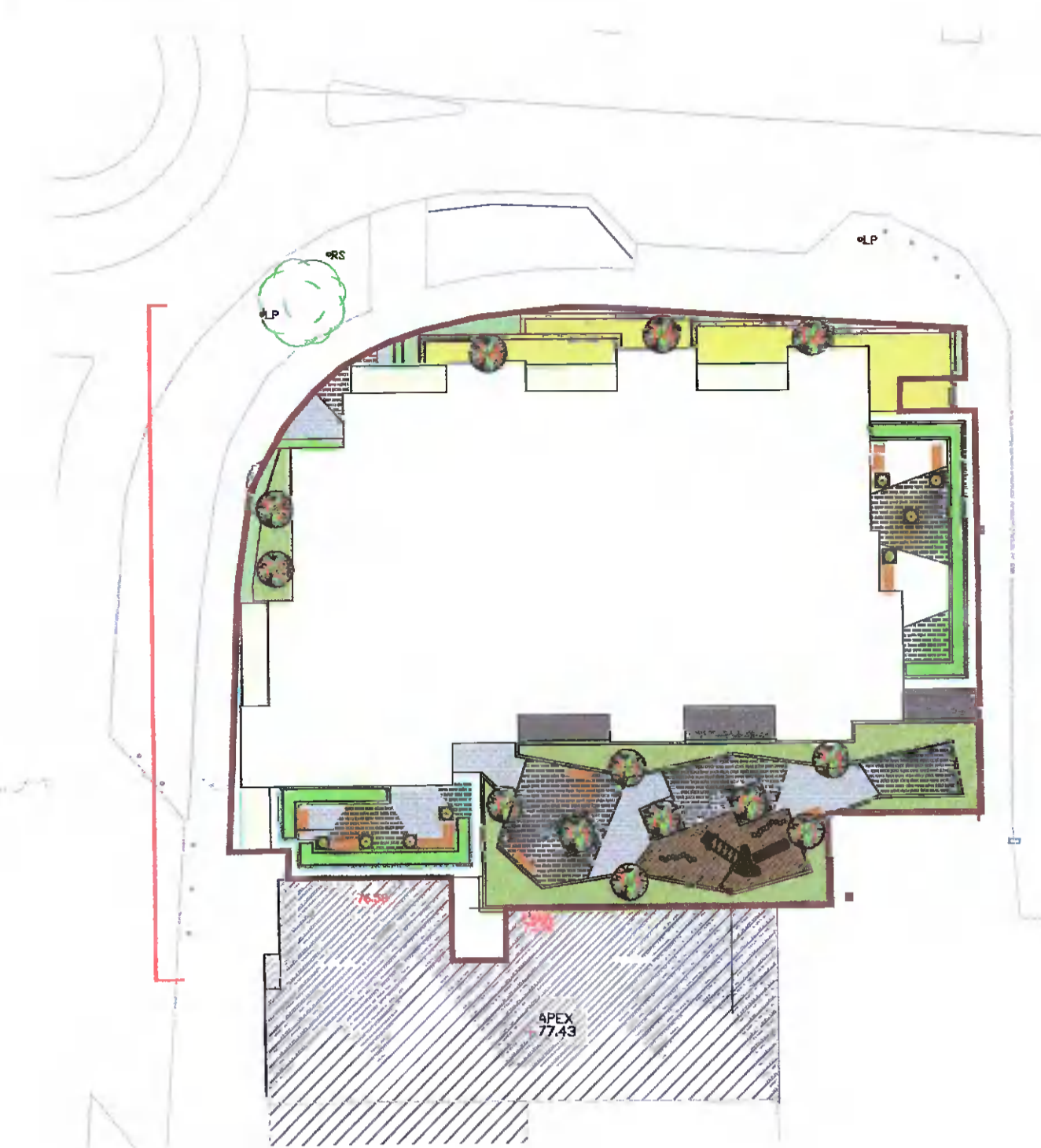
Landscape Plan Scale NTS