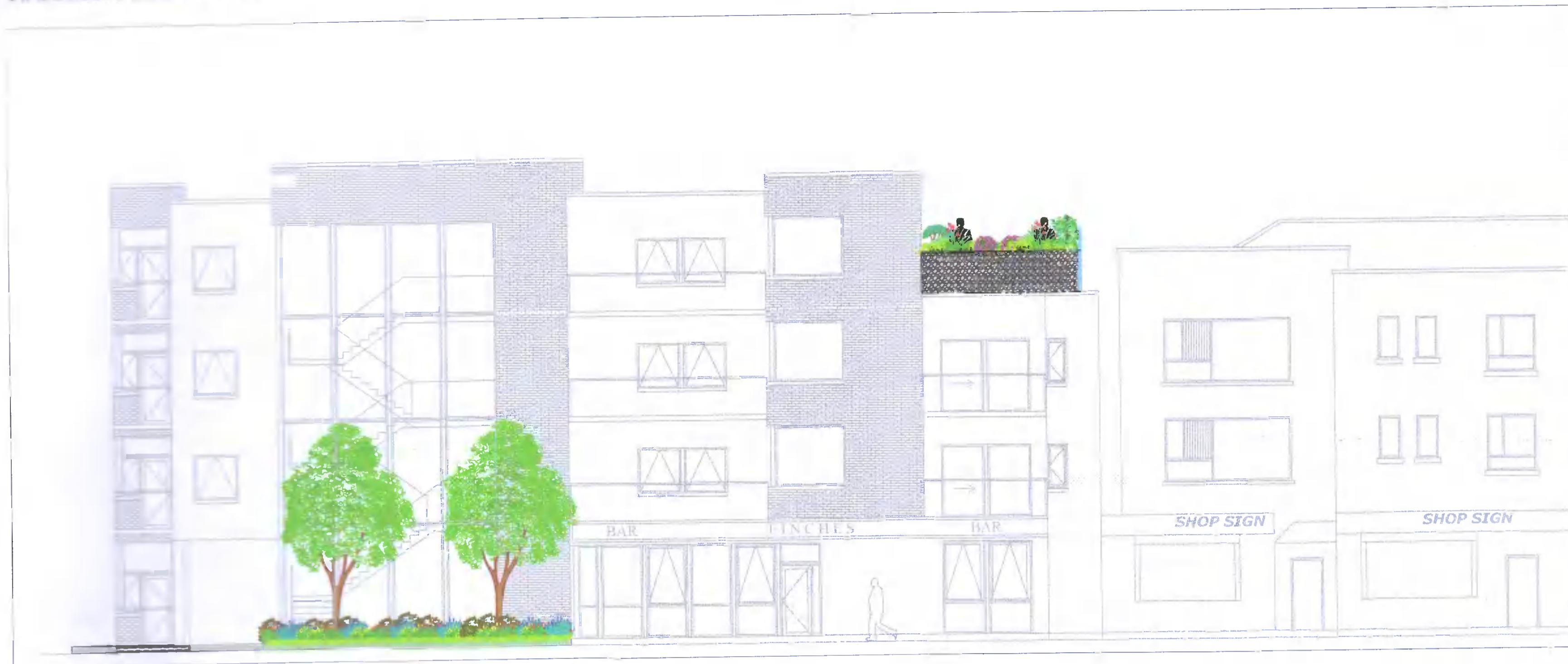
Western Elevation Scale 1:100